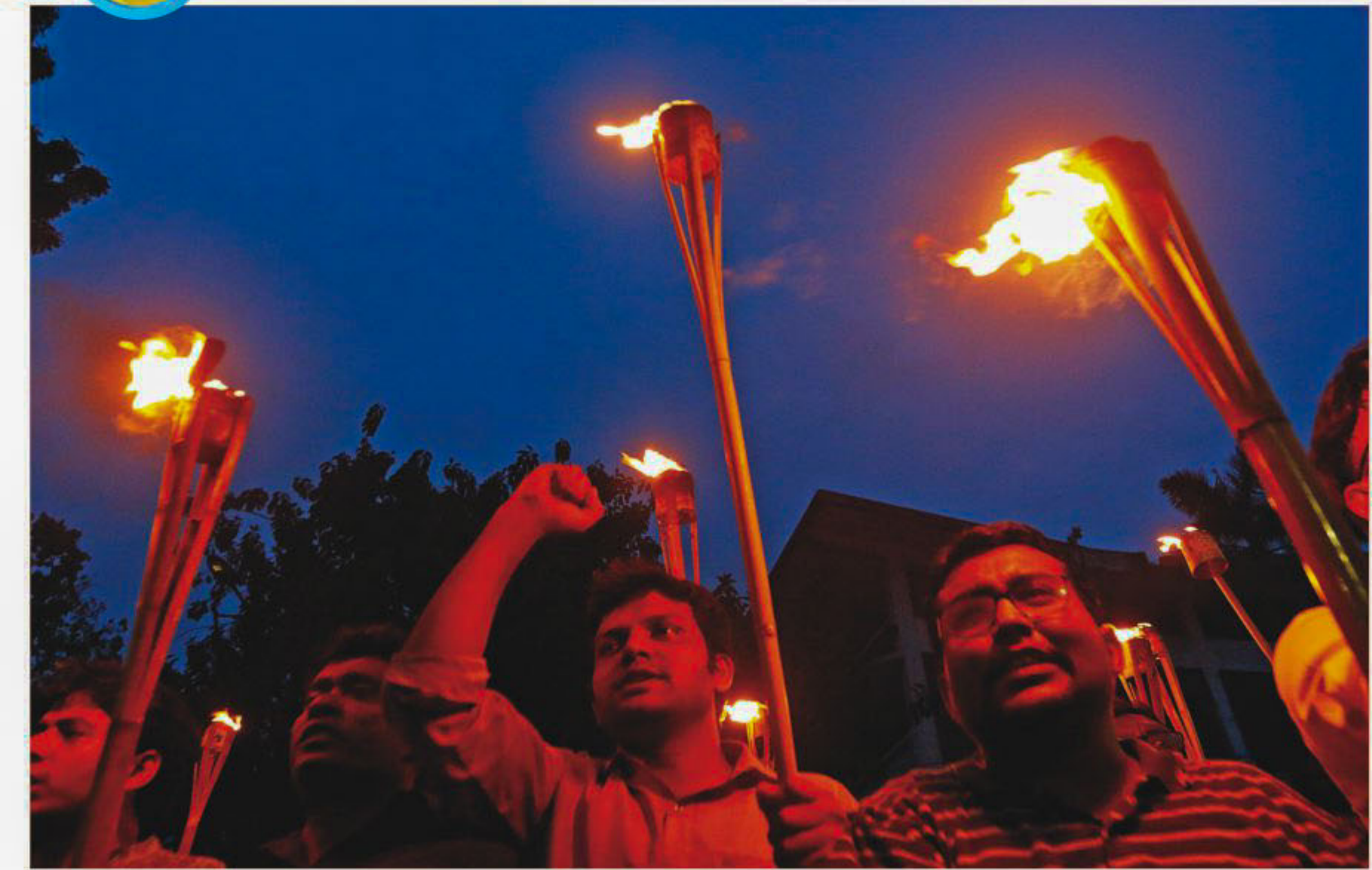
Pragatishil Chhatra Jote yesterday brought out a torch rally on the Dhaka University campus demanding removal of gas price hike, and increasing education allocation to 25 percent in the national budget.