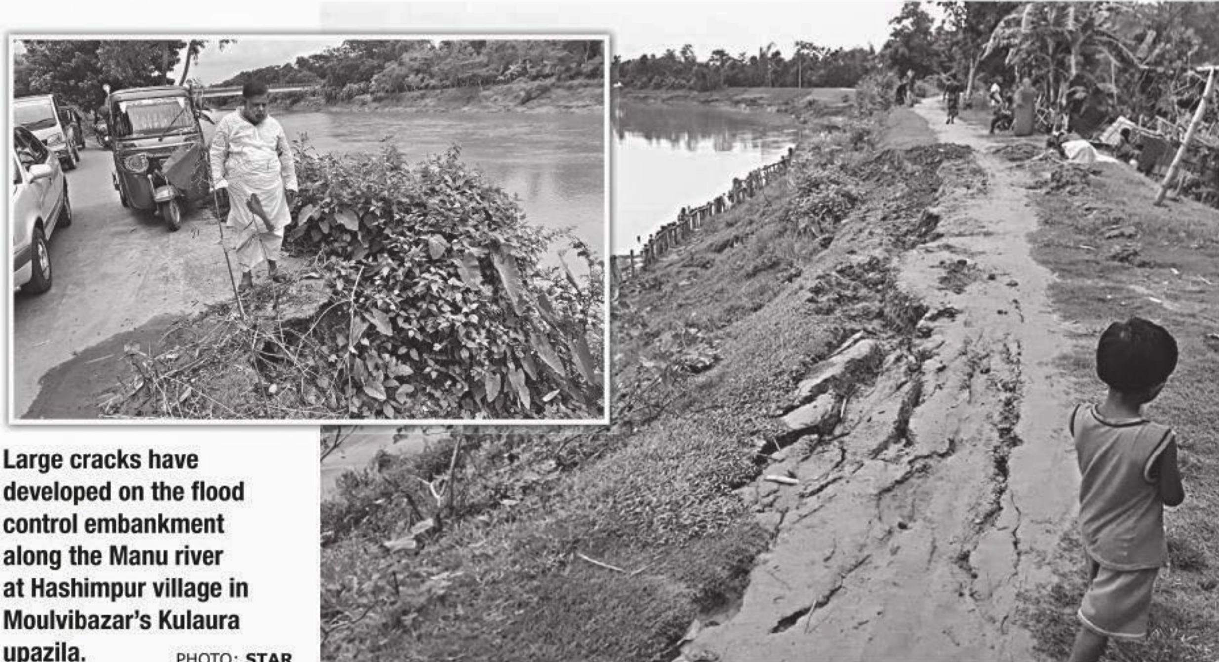
Large cracks have developed on the flood control embankment along the Manu river at Hashimpur village in Moulvibazar's Kulaura upazila.