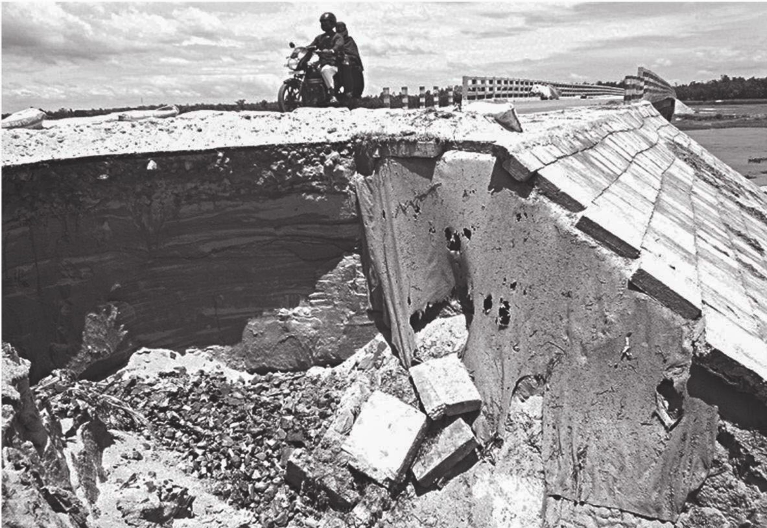
A collapsed portion of the approach road and guide wall of this 15-month-old bridge over the Charalkhata river on Nilphamari-Kishoreganj road at Bajitpara village in Nilphamari Sadar upazila.