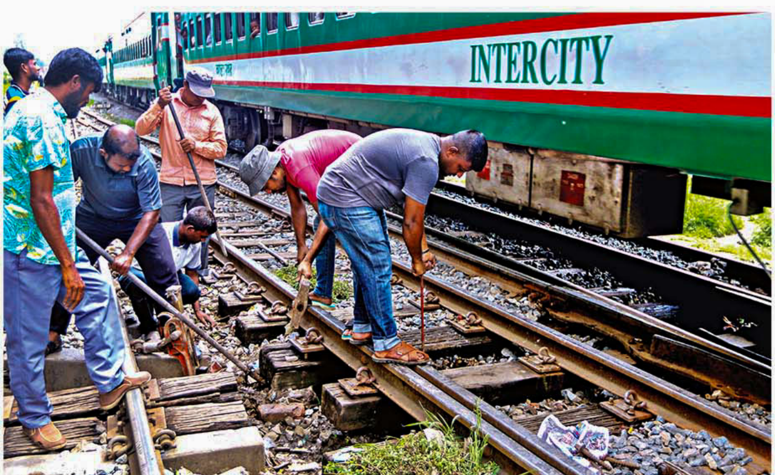
Workers of Bangladesh Railway check train tracks for faults or structural weaknesses to fix in the capital's Tejgaon. The photo was taken on Wednesday.