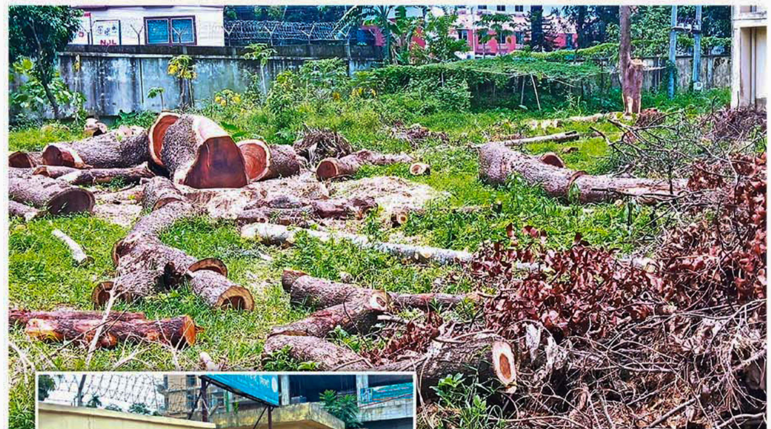
Bangladesh Poribesh Andolon formed a human chain in front of Bangladesh Betar's Sylhet office on Wednesday, inset, protesting felling of 143 trees by the broadcasting agency on its premises, allegedly without clearance from the Forest Department.

"As we move into the age of data, online safety has become a global issue for people of all ages, especially children, how it's impacting our society and our future generations. But we cannot ignore how the internet has become a necessity for a child's learning, development and growth." The partnership will also address offline protection issues through its focus on creating sustainable and embedded solutions inside schools. This will support creating a forum or Safe Clubs within participating schools where child protection issues can be addressed. "As part of our global commitment to the United Nations Sustainable Development Goal 10: Reducing Inequalities, we are committed to educating four million children on child online safety across our markets SEE PAGE 4 COL 3