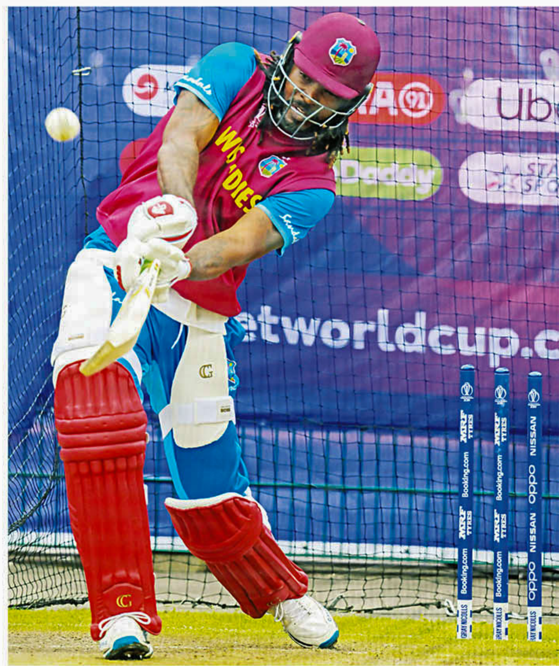
Universe Boss Chris Gayle has failed to make any sort of impact at the World Cup so far, but he will be hoping to rectify that when he meets Afghanistan today. The 39-year-old will be especially hoping to make it an occasion to remember as it will be his last World Cup match.