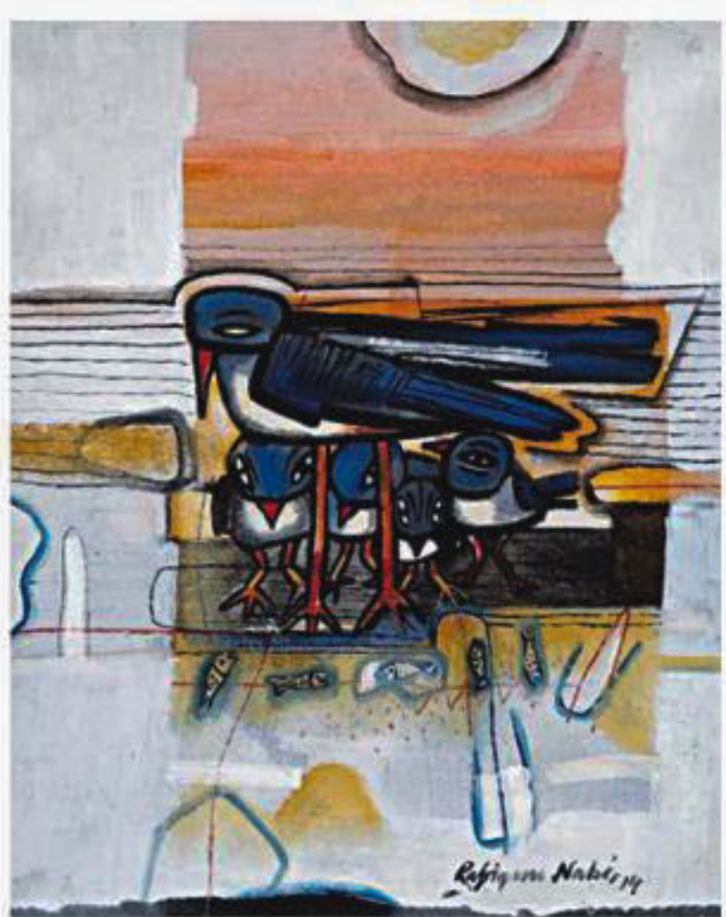
Rafiqun Nabi's 'Kingfishers'.