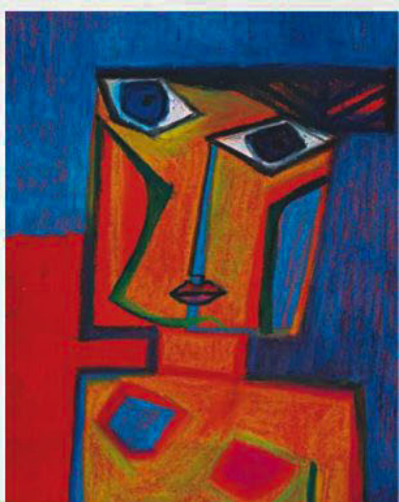
Murtaja Baseer's 'Women-2'.