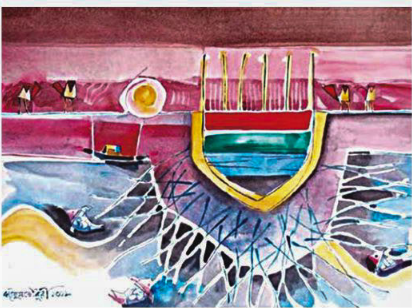
Qayyum Chowdhury's 'Golden Bengal'.