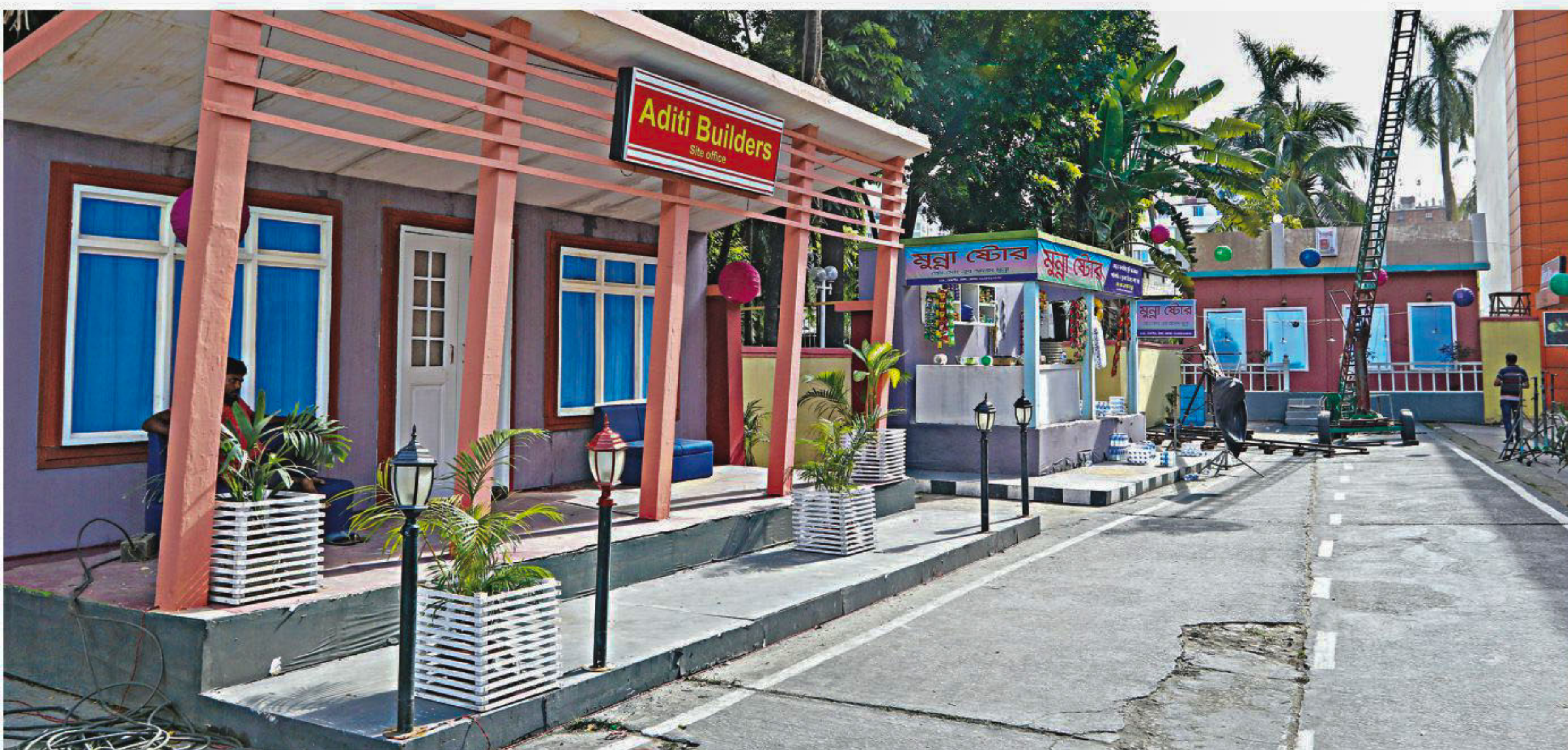
The newly built sets at Bangladesh Film Development Corporation (BFDC).