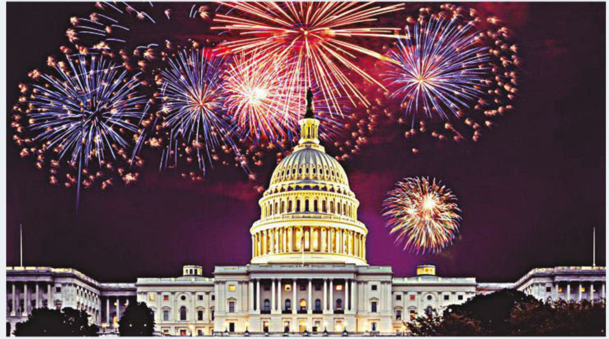
Fireworks light up the sky on the 4th of July

The story of America is our striving, imperfect and ongoing, to live up to our founding ideals, to understand our country's