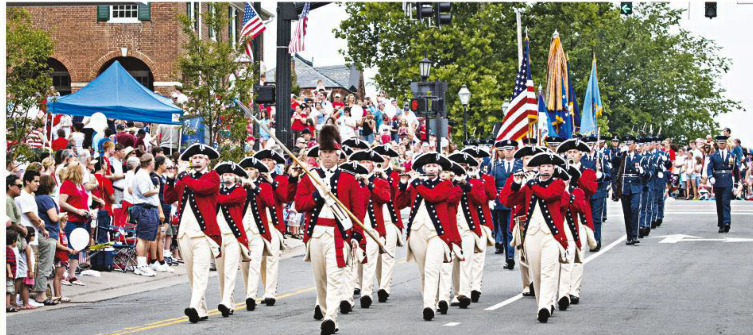
Independence Day is a time for Americans to celebrate the history of the United States. No parade would be complete without a fife-and-drum band in period costume.

THE founders of the United States knew that independence was something to celebrate. And although U.S. Independence Day celebrations have evolved over time, July 4th festivities remain an important part of American life.