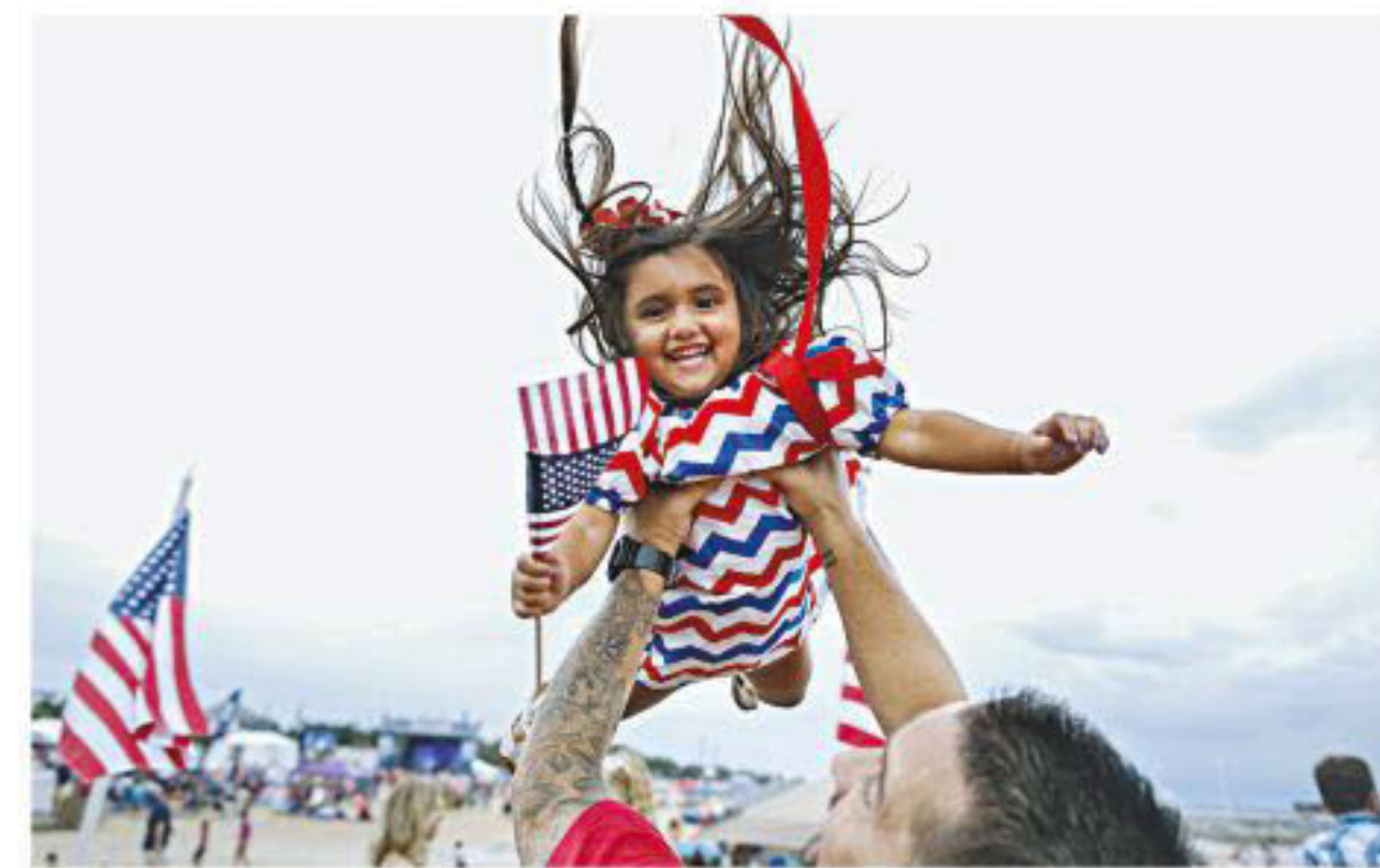
A father and daughter enjoy the Fourth of July in Waveland, Mississippi.

Today, most citizens celebrate in much the same way as Americans did during the 18th century, with parades, picnics, neighborhood parties, outdoor concerts, sporting