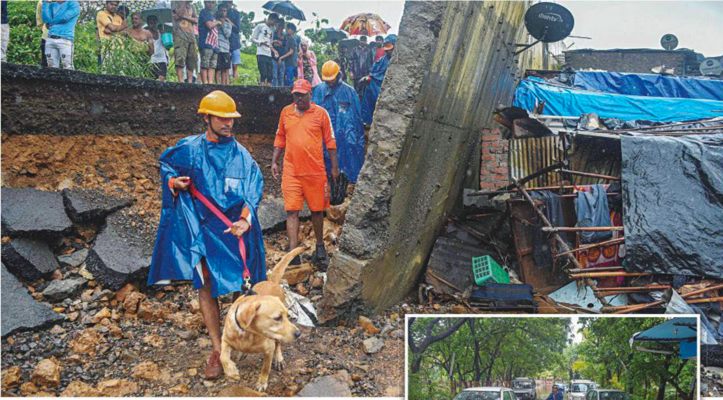
Rescue workers use dogs to search for survivors at the site of a wall collapse in Mumbai yesterday. At least 30 people were killed in the India's financial capital when multiple walls collapsed during torrential monsoon downpours. Inset, a man walks with a bicycle along a waterlogged street in Mumbai.