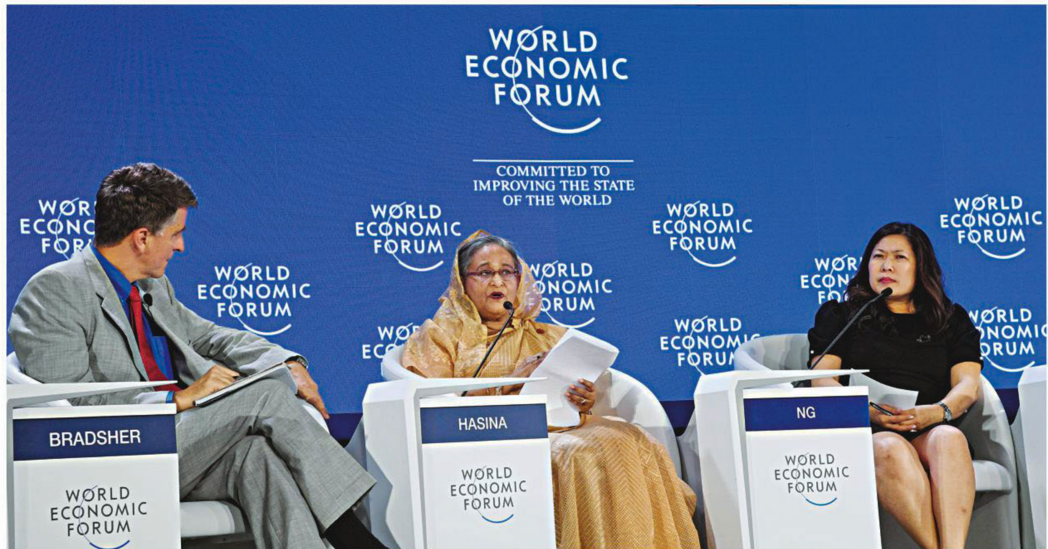
Prime Minister Sheikh Hasina addresses a panel discussion on “Cooperation in the Pacific Rim” during the World Economic Forum’s annual meeting at Dalian International Conference Centre in China’s Dalian city yesterday.

But he could not explain how every line, every word and every punctuation of three statements could be in the exact same order.