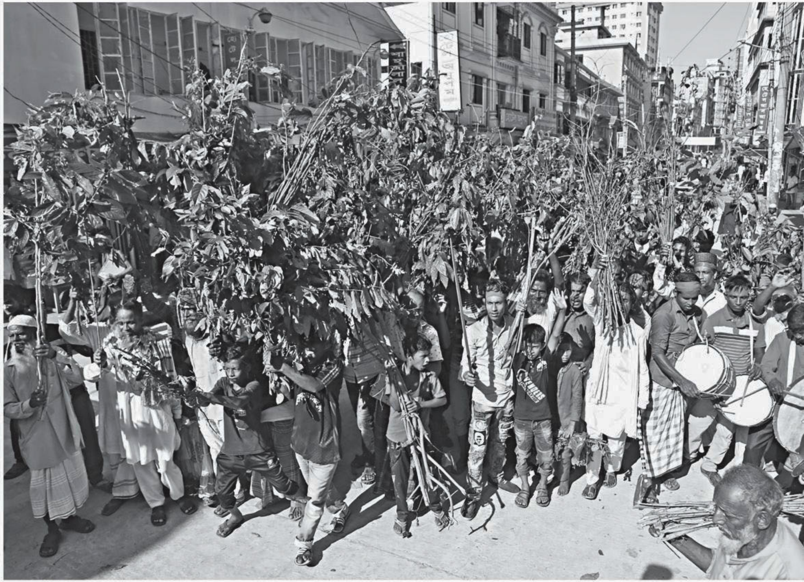
Marking the Urs (death anniversary) of Hazrat Shahjalal (R) at his shrine in Sylhet, the "lakri tora" ritual has begun in the city. It is said the Muslim saint used to collect firewood this way, and hundreds of his followers have kept the tradition alive in his memory for over 700 years, collecting tree branches from Lakkatura and Malnichhara near the city.

The mayor said he has lobbied with the government for capital dredging of river Padma, and initiating a process of establishing an international river port in Rajshahi.