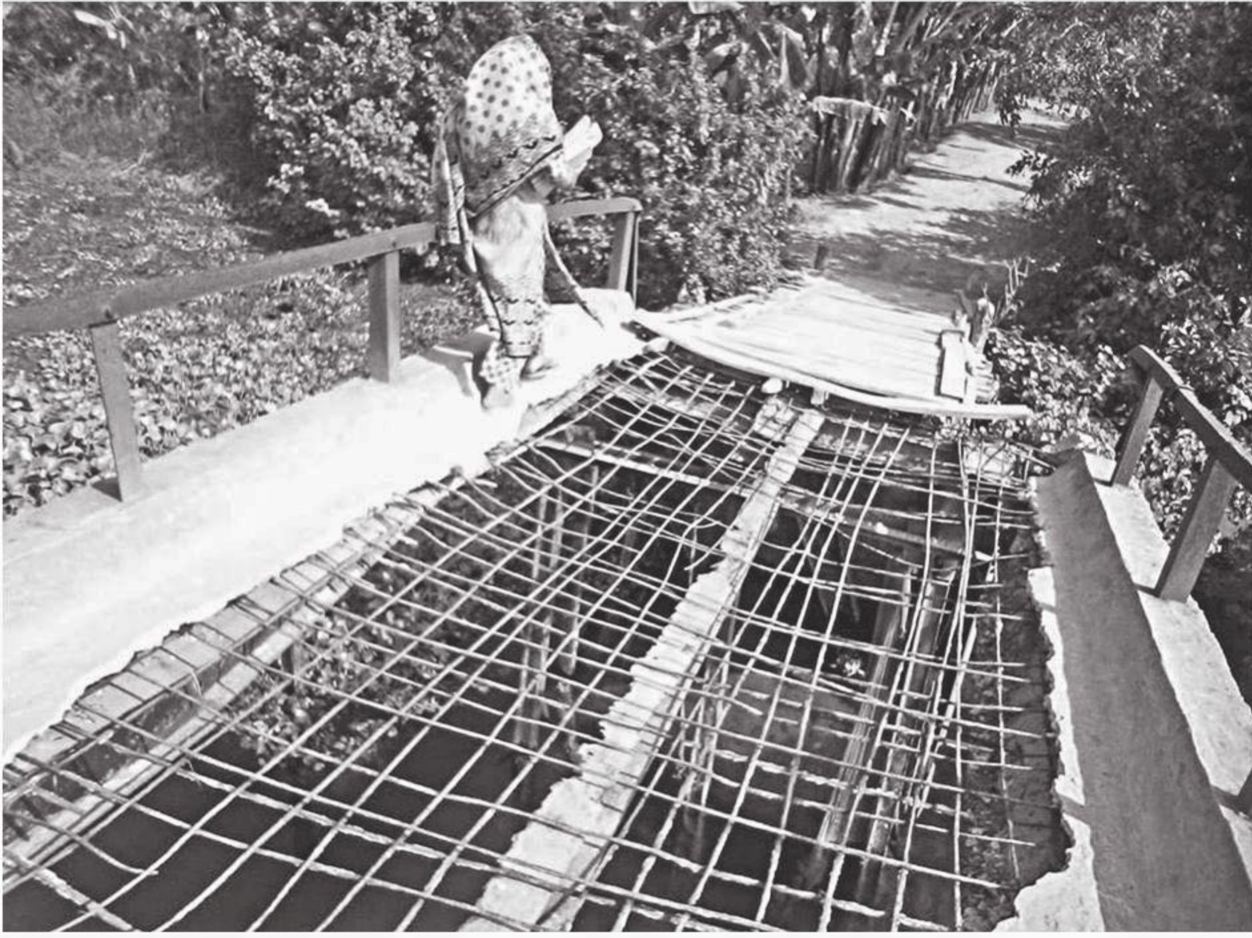
A woman crosses the broken bridge on Nayabhanli canal in Barguna's Taltali upazila amid risk of accident. The photo was taken a few weeks ago.