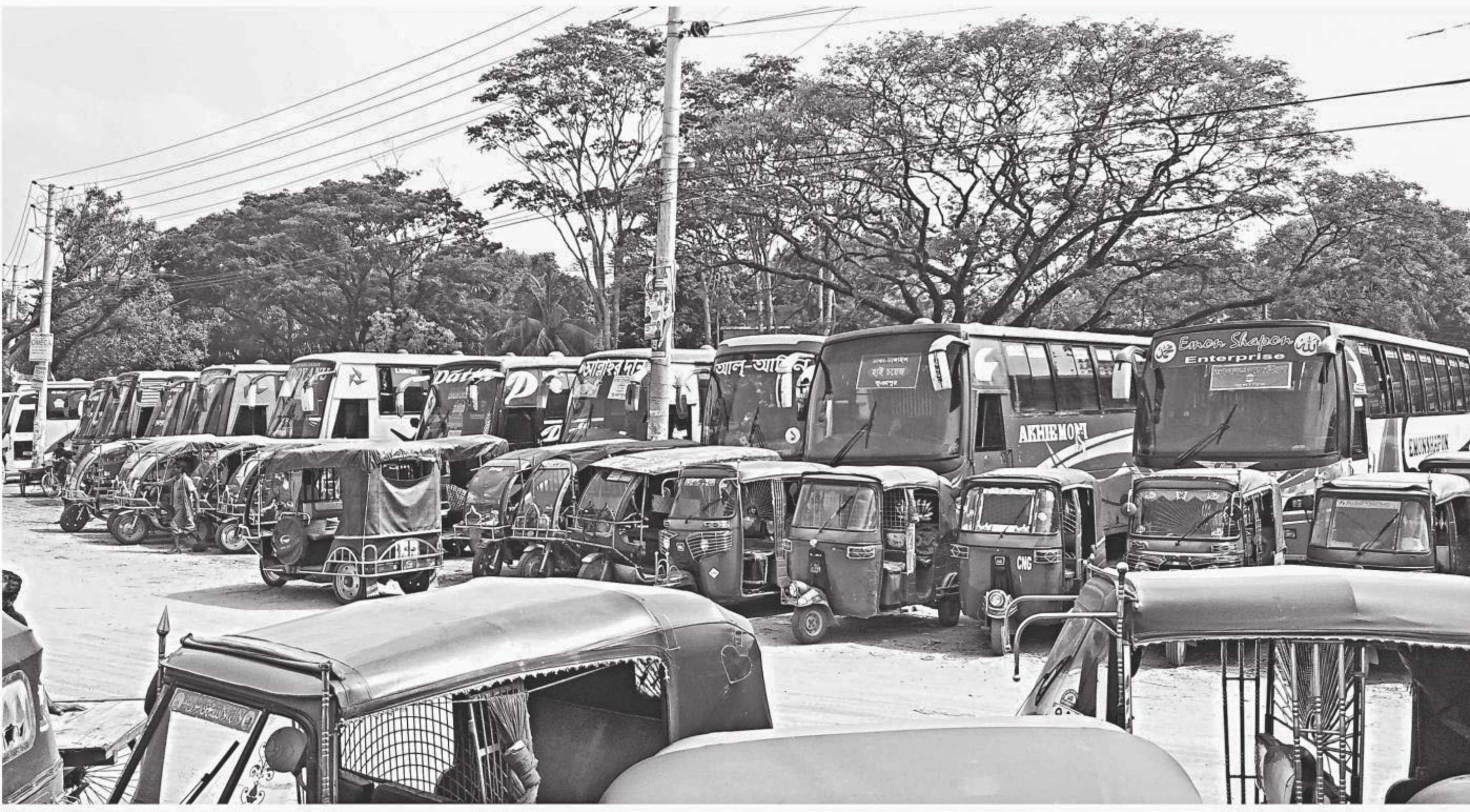
This bus stand, set up illegally beside a busy road in Tangail's Bhuapur upazila headquarters, has been creating traffic jam and causing sufferings to the commuters for long.