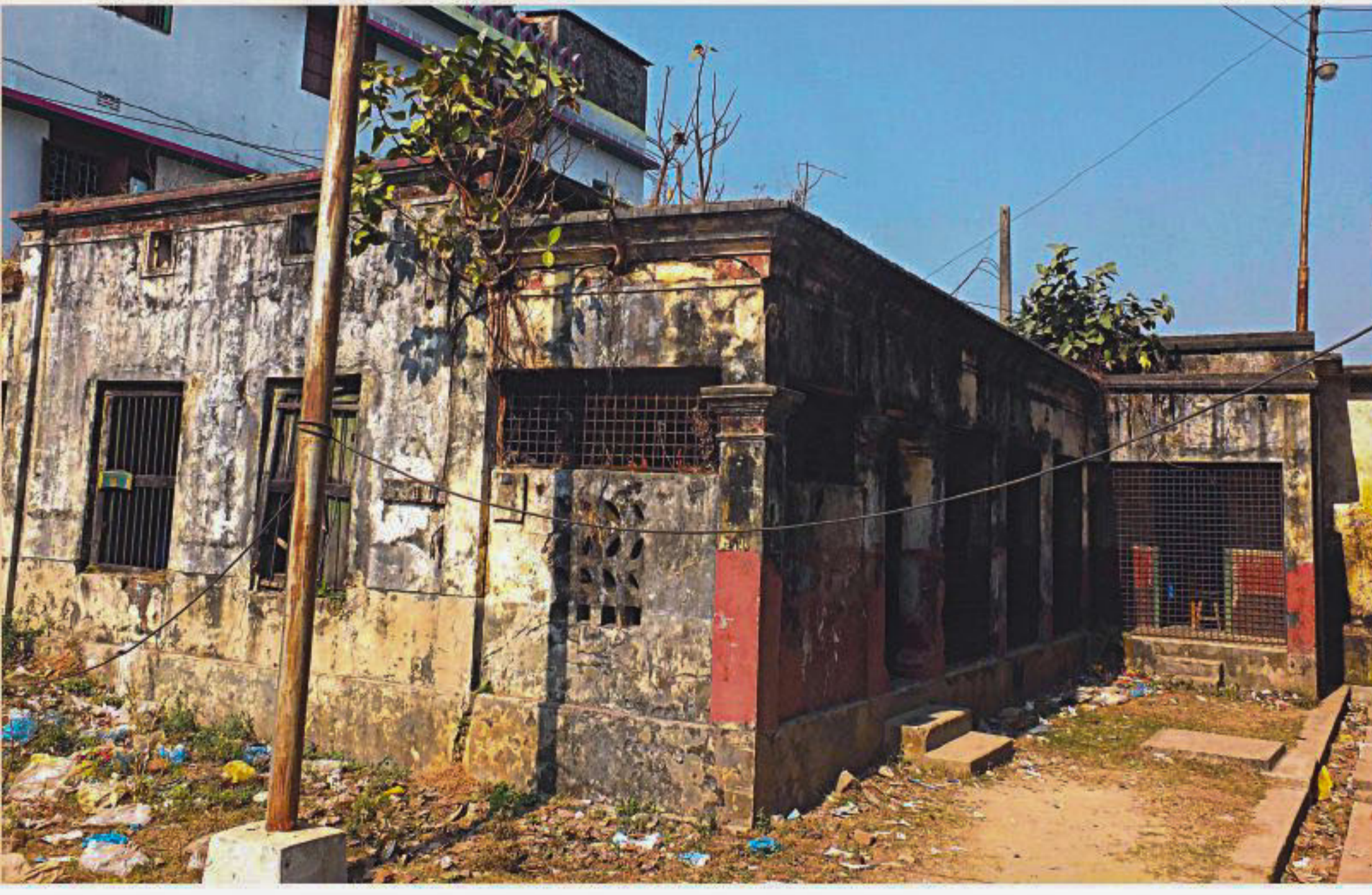
The dilapidated state of the Boromi union sub-centre health facility in Sreepur of Gazipur.

70pc public healthcare facilities don't have thermometers, stethoscopes, blood pressure gauge, weighing scales, torchlights