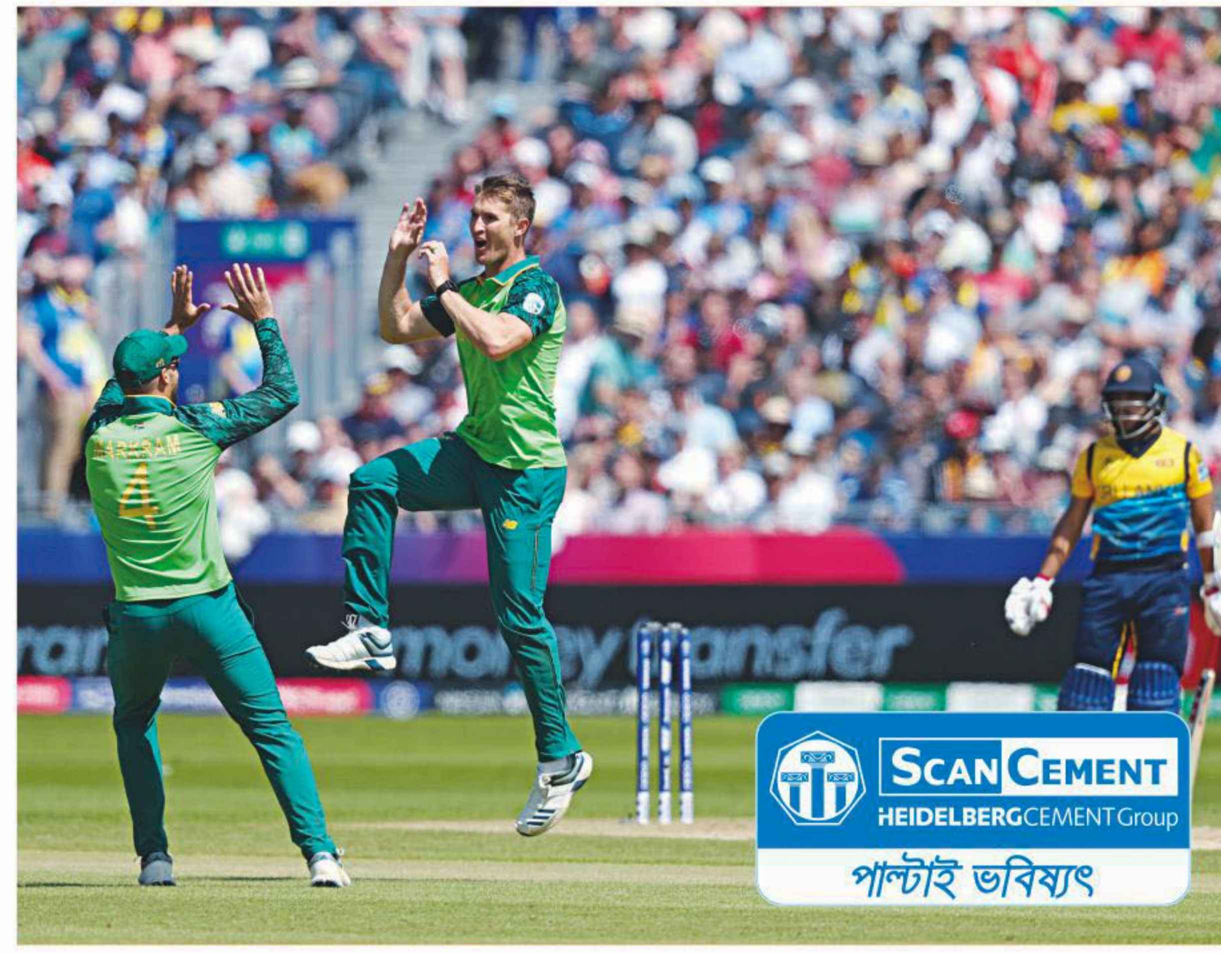
South Africa pacer Dwaine Pretorius scalped three wickets to help restrict Sri Lanka to 203 runs in a World Cup encounter yesterday.