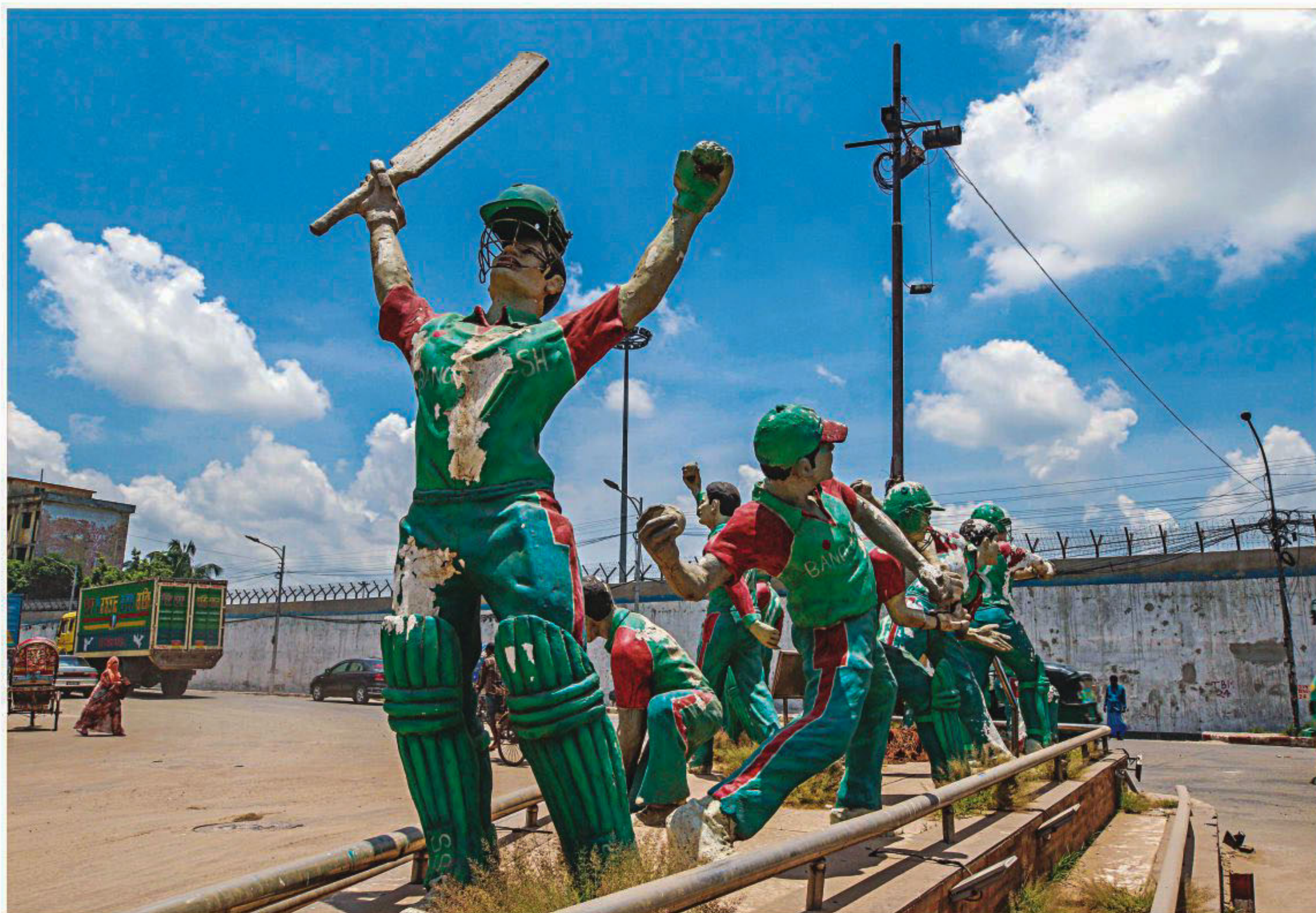
Built ahead of the 2011 ICC Cricket World Cup, these sculptures of cricketers in Chattogram city's Nimtala Biswa Road area are falling to pieces for lack of maintenance. The photo was taken this week.