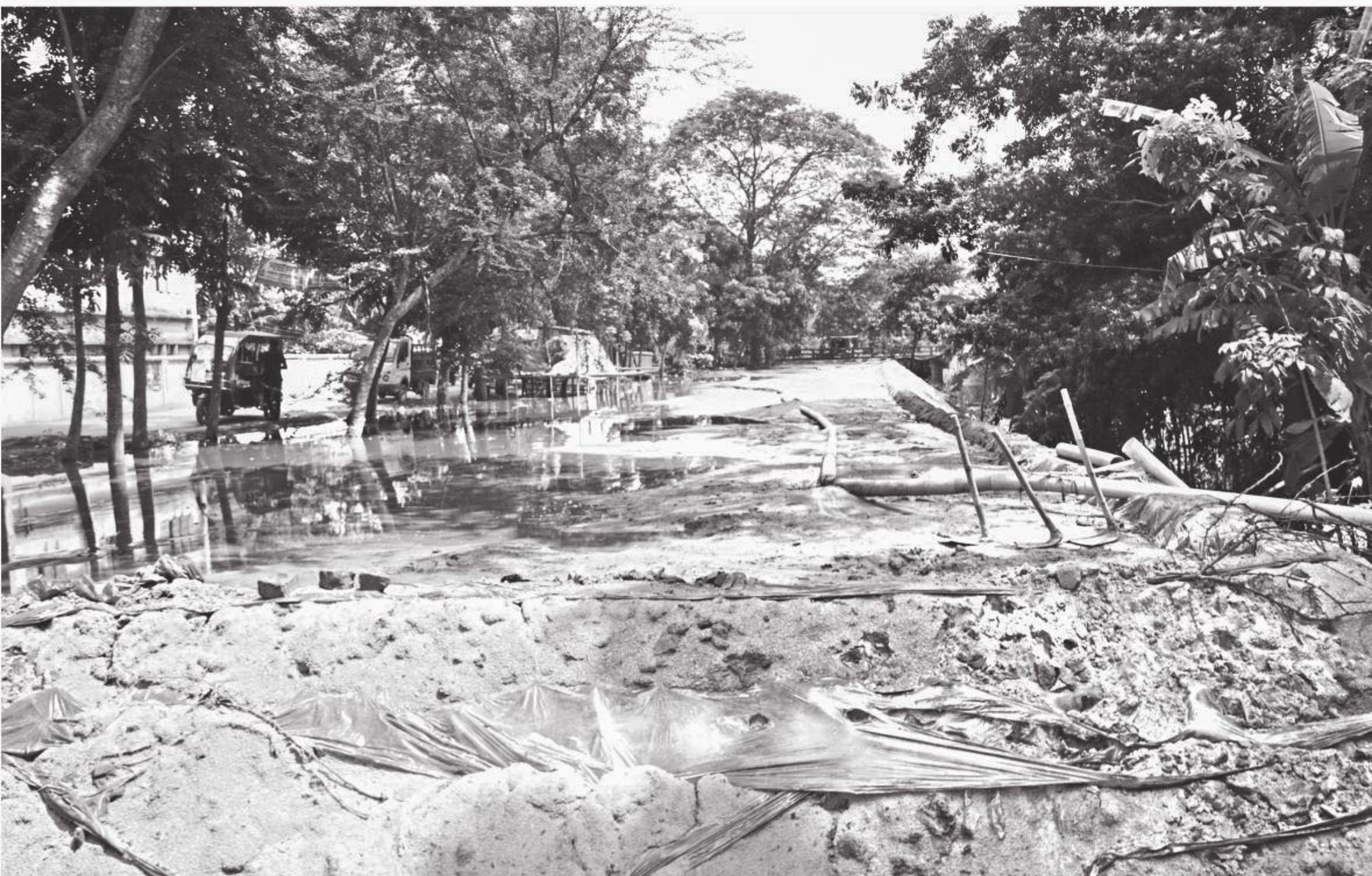
A part of the canal that has been filled up by Sadarpur Upazila Parishad. The photo was taken recently.