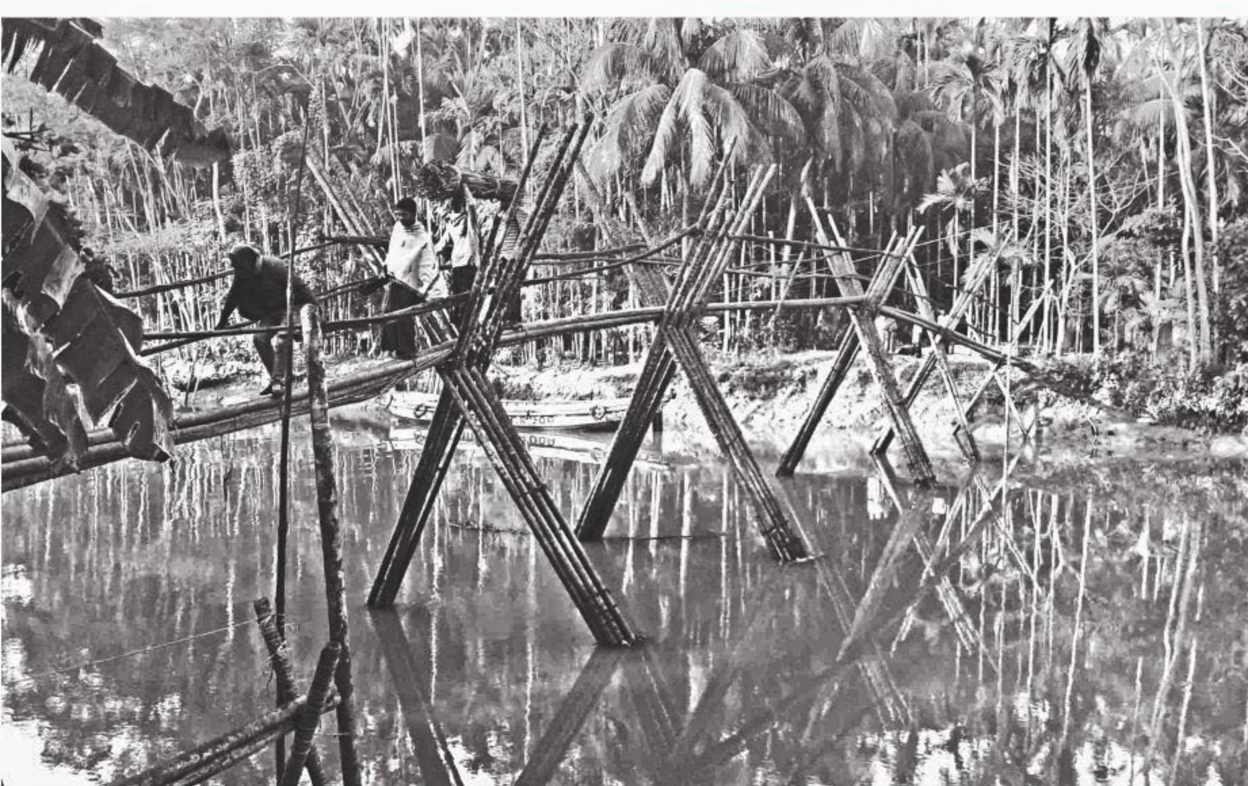
People have to cross amid risk the rickety bamboo bridge at Singor-Chandipur village in Morrelganj upazila of Bagerhat as the authorities concerned have not taken any initiative after a concrete bridge at the spot collapsed 12 years ago.