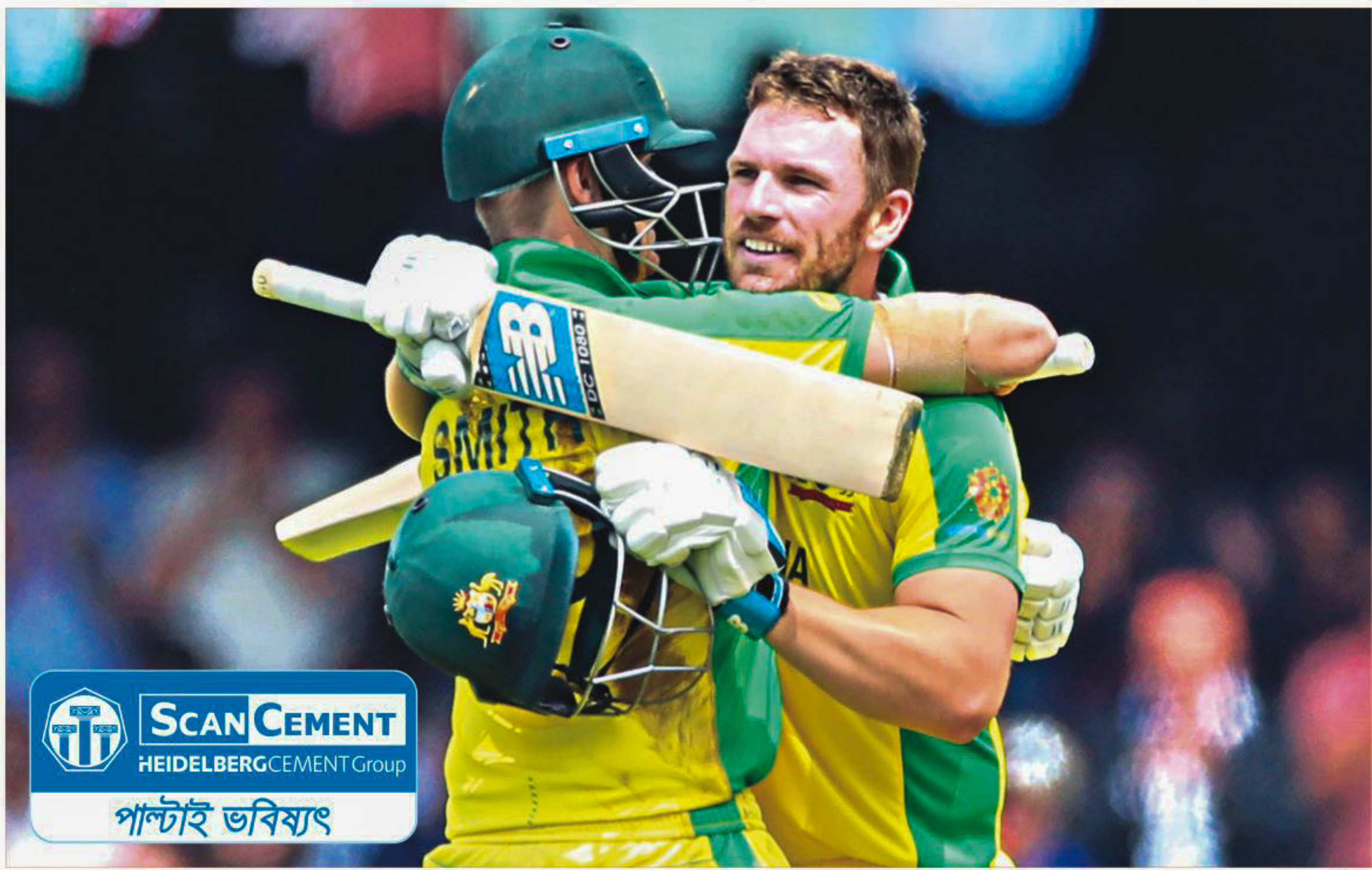
Australia opener Aaron Finch (R) embraces teammate Steve Smith after scoring a century in their ICC World Cup match against England at Lord's in London yesterday. Finch's 116-ball 100 helped the Aussies defeat England by 64 runs and put his team into the semifinals.