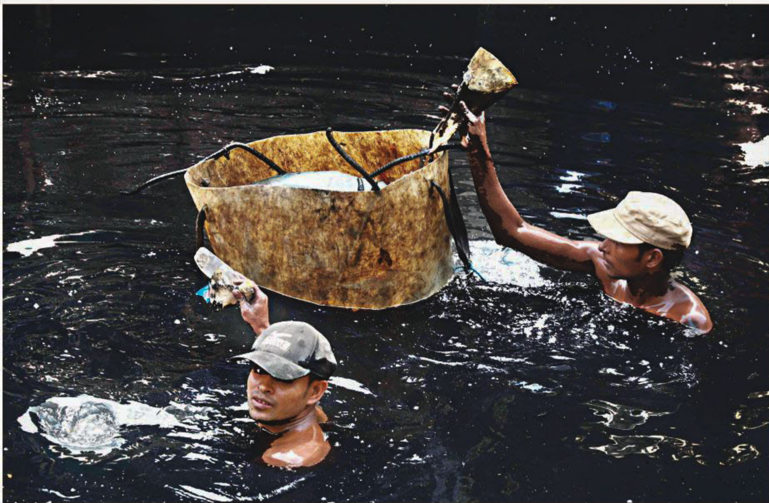
Two young men collect discarded plastic bottles, cans and pieces of glass from the pitch black water of the Zia Sharani Canal in the capital's Shanir Akhra area. Despite the risk of developing skin diseases, many from poverty-stricken families get involved in such hazardous work for a living by selling those discarded items. The photo was taken recently.