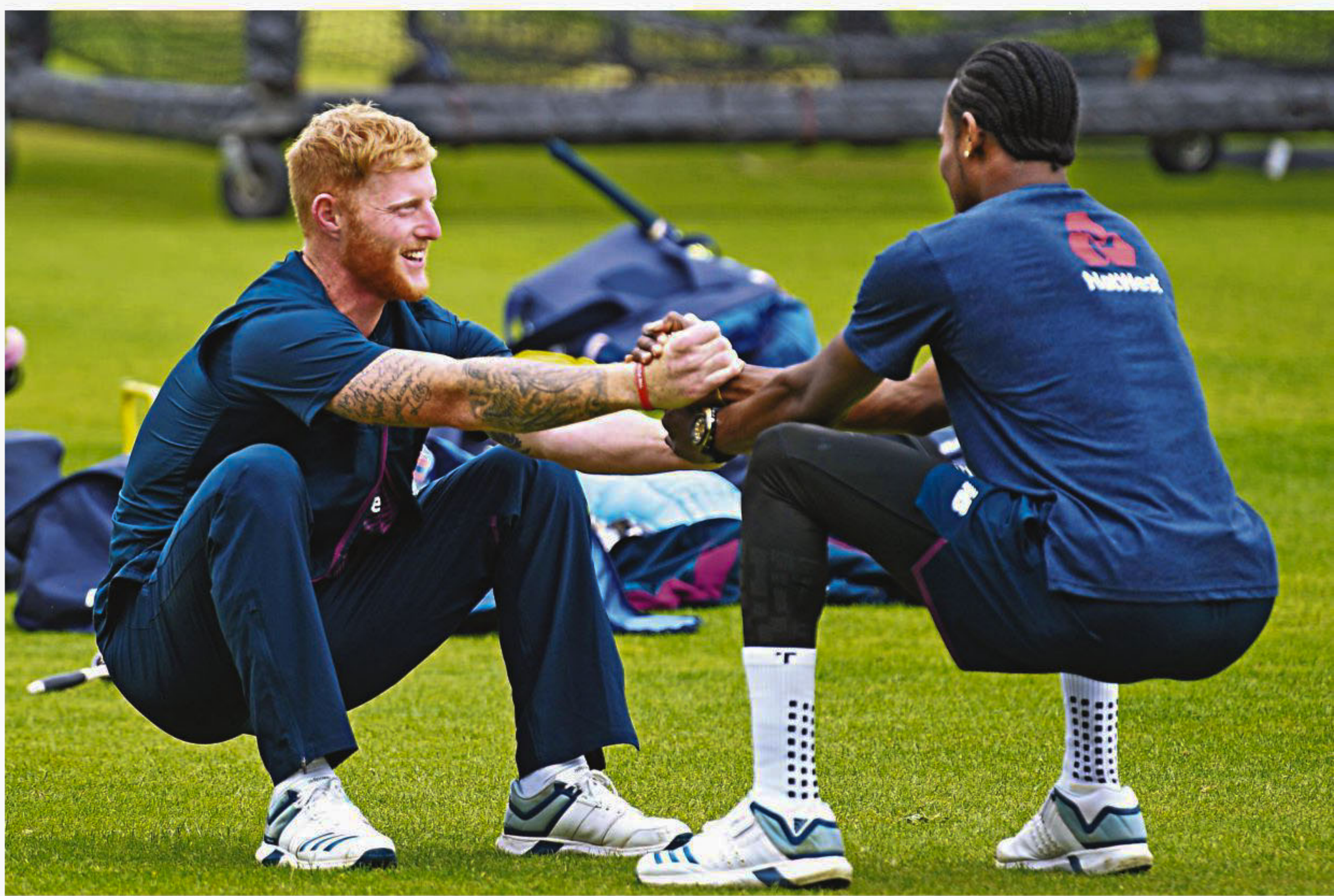
He will have front row seats to England's destructive batting line-up, but coming into the match on the back of his second World Cup century, Australia opener David Warner (L) will be hoping for another big knock against their archrivals today. However, England will come at Australia with plenty of their own firepower, including the express pace of Jofra Archer (R) and the all-round brilliance of Ben Stokes.