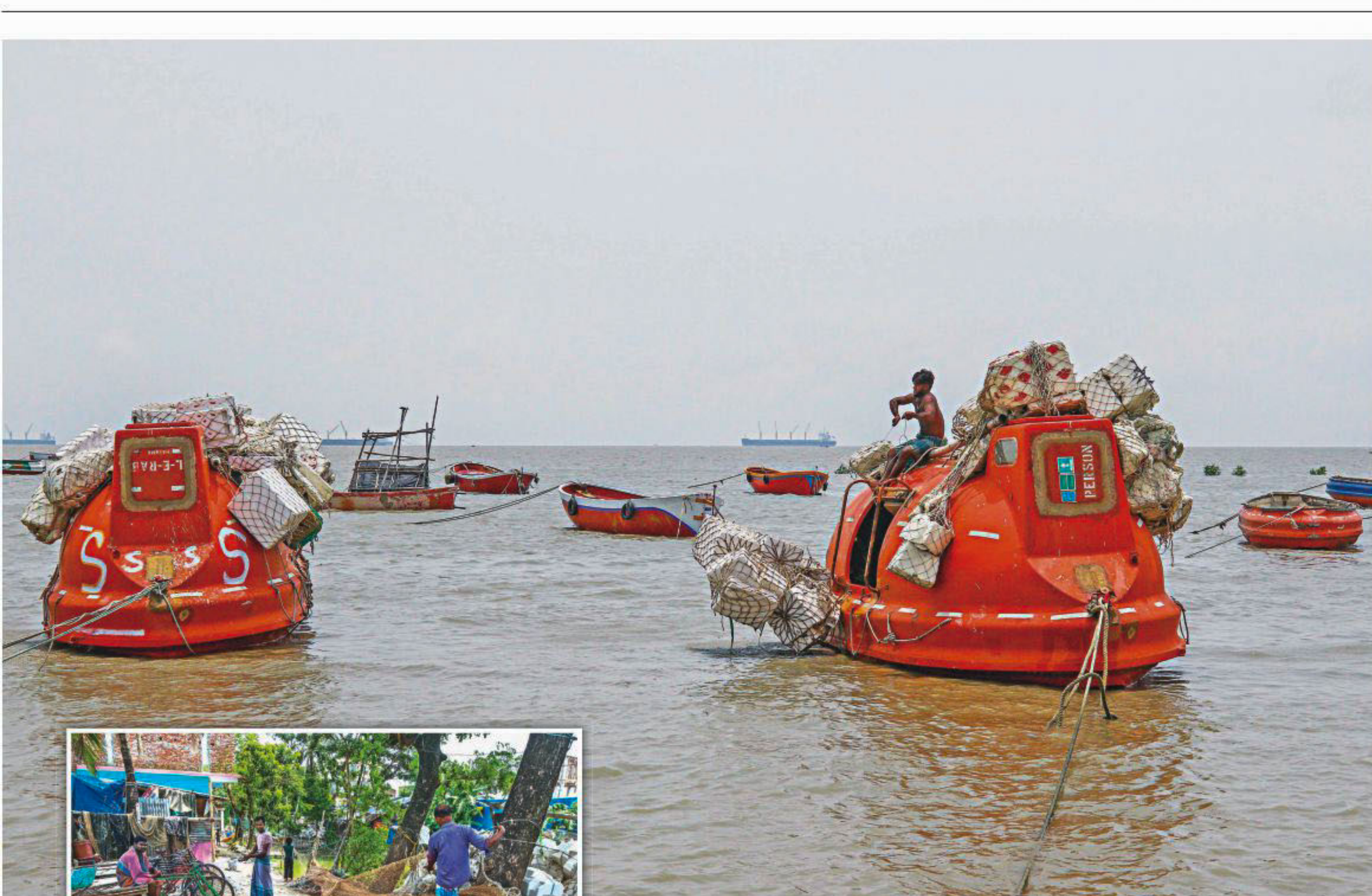
Fishermen washing styrofoam, buoys and making nets, inset , in Chattogram city's Ananda Bazar on Sunday. Many of the fishermen in the area, who are going through a hard time amid a 65-day ban on netting fish in the Bay of Bengal since May 20, alleged that they did not receive rice from government in compensation.