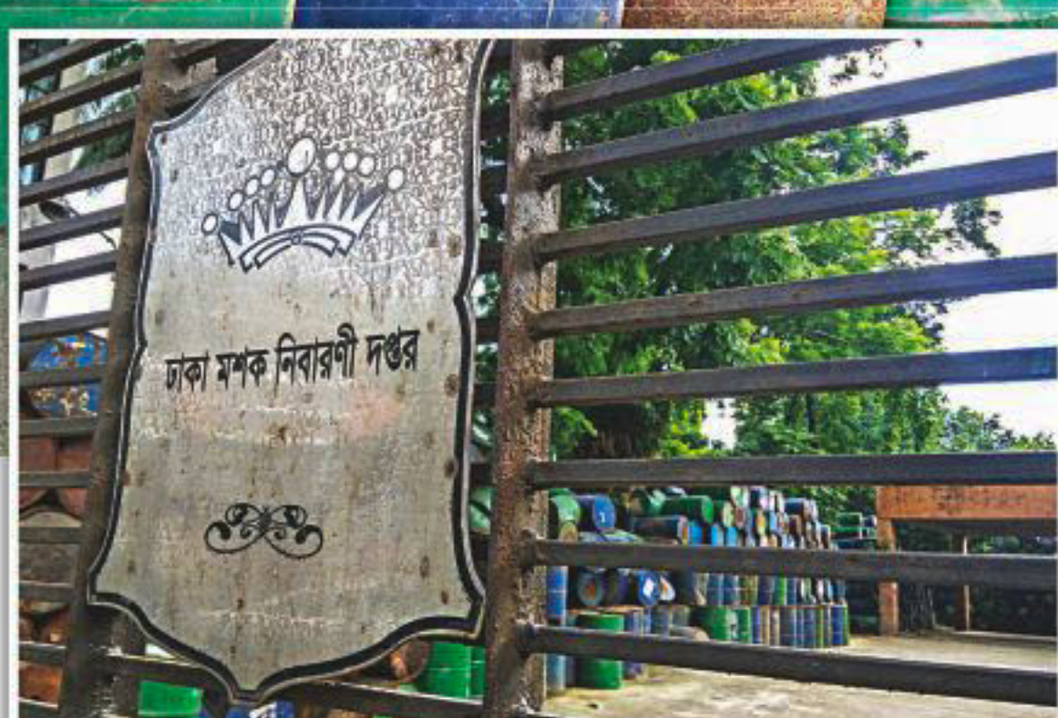
Stacked, barrels of insecticides rust on the premises of Dhaka Mosquito Control Office near Bakshibazar yesterday. Dengue cases in the capital have increased in recent months and a DGHS survey has found high level of Aedes larvae in several places of the city.