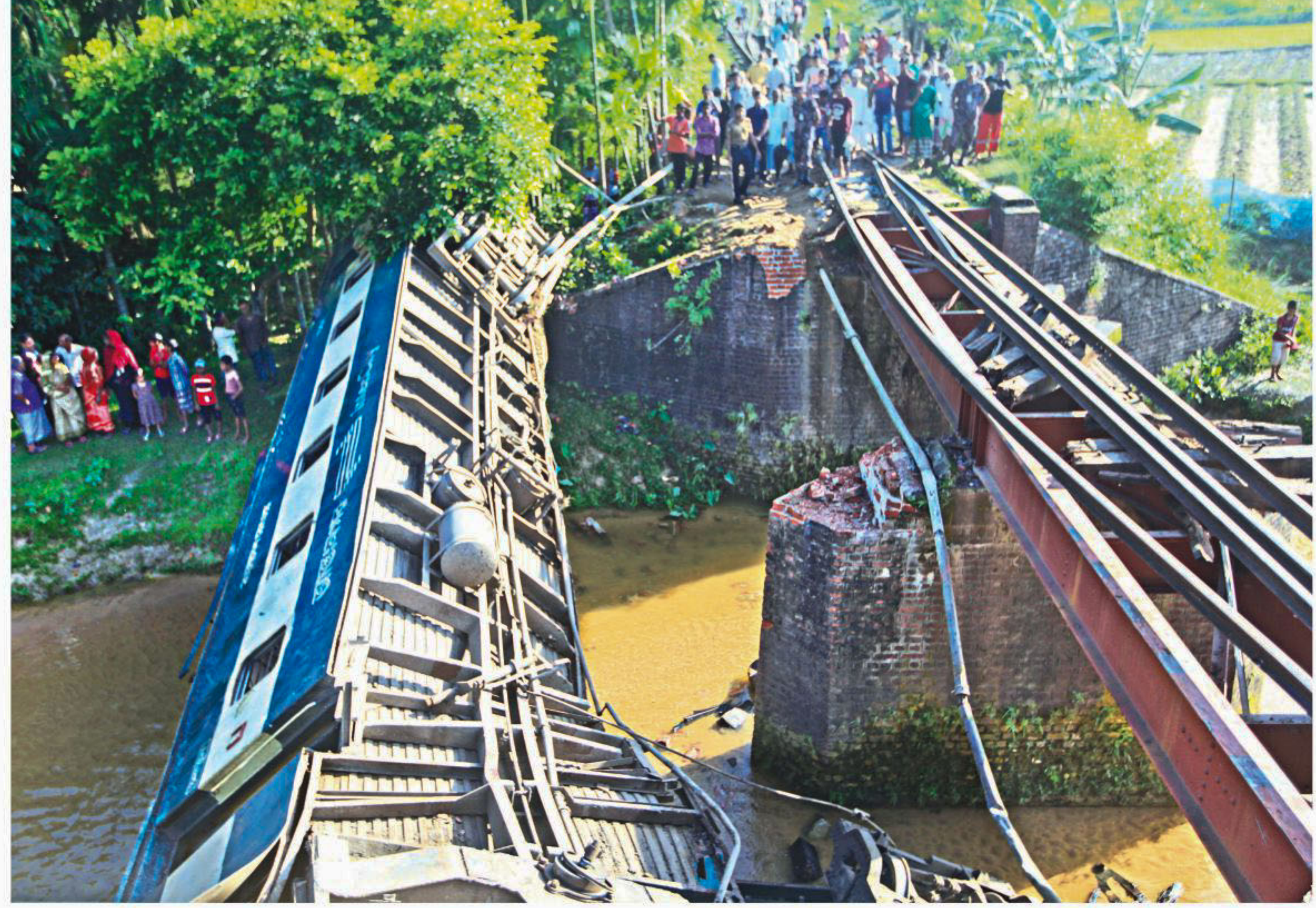
Locals gather near one of the six carriages of Upaban Express that derailed in Moulvibazar's Kulaura on Sunday night leaving four people dead.