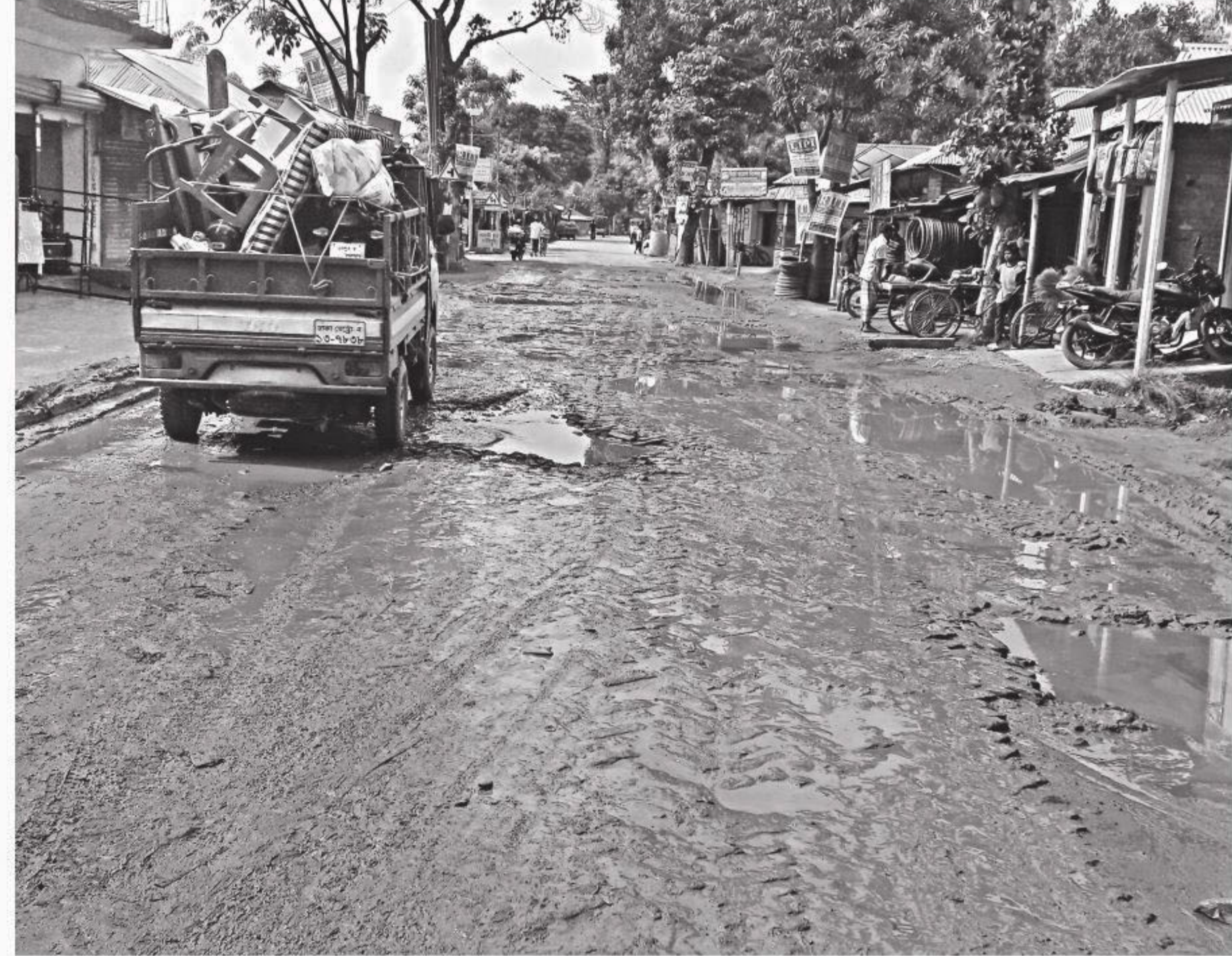
A pickup van plies the risky Mahendranagar-Mostofi road, which connects Lalmonirhat-Burimari and Rangpur-Kurigram highways, in Lalmonirhat Sadar upazila. The photo was taken a few days ago.

The contractor will be given work order very soon, he said.