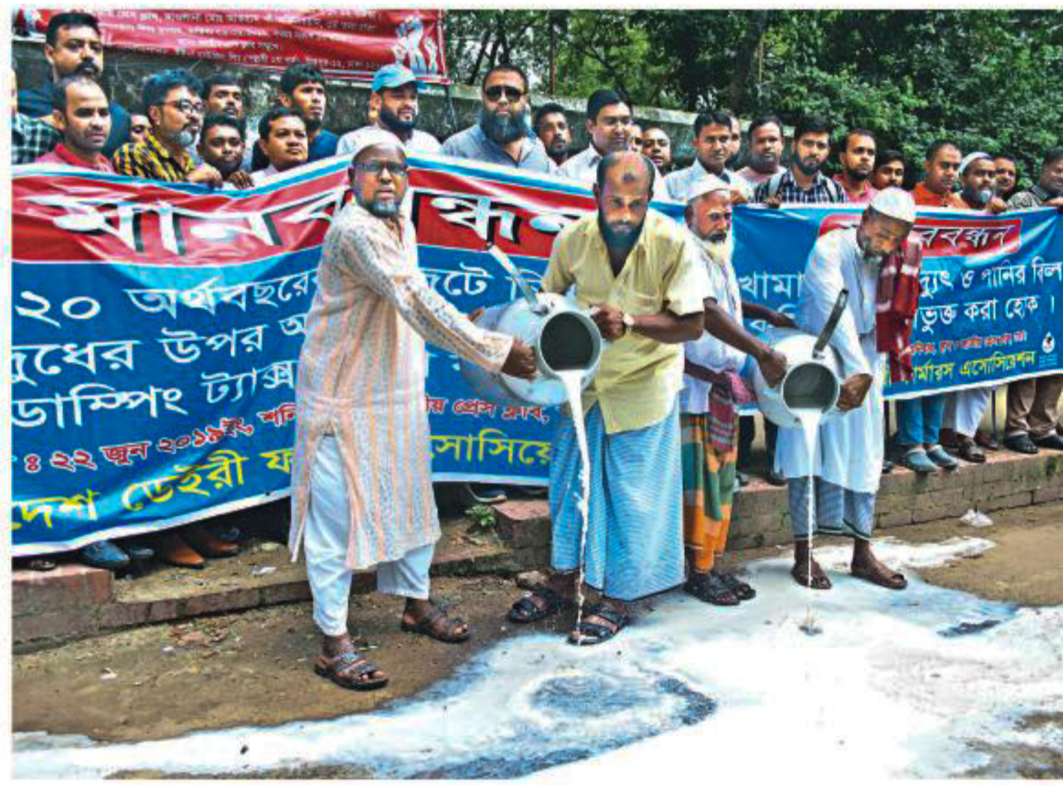
Dairy farmers dump milk in front of National Press Club in Dhaka yesterday terming "low" the proposed tariff hike on milk import from 5 to 10 percent.

The country's requirement for milk is 1.50 crore tonnes.