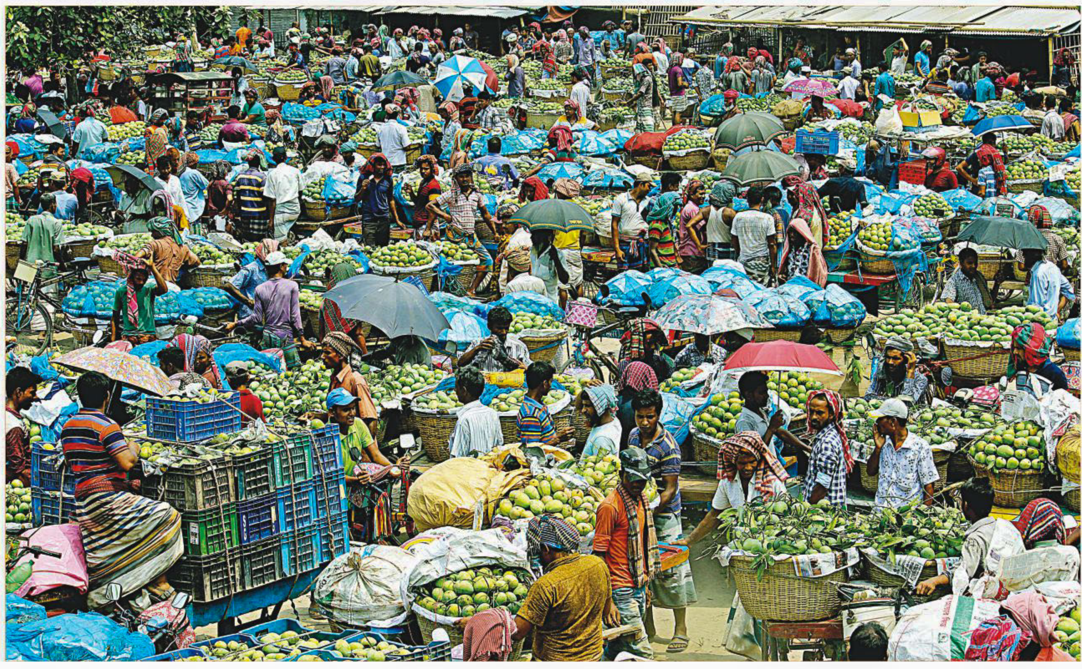
The Kansat mango market in Chapainawabganj is abuzz with buyers and sellers. Although the prices are higher compared to last year, growers are not happy due to lower production of the summer fruit this year, thanks to adverse weather conditions. The fruit was selling for between Tk 2,500 and Tk 4,000 per maund depending on the size, quality and variety, up from Tk 1,600 to Tk 2,800 last year. The photo was taken on Wednesday.