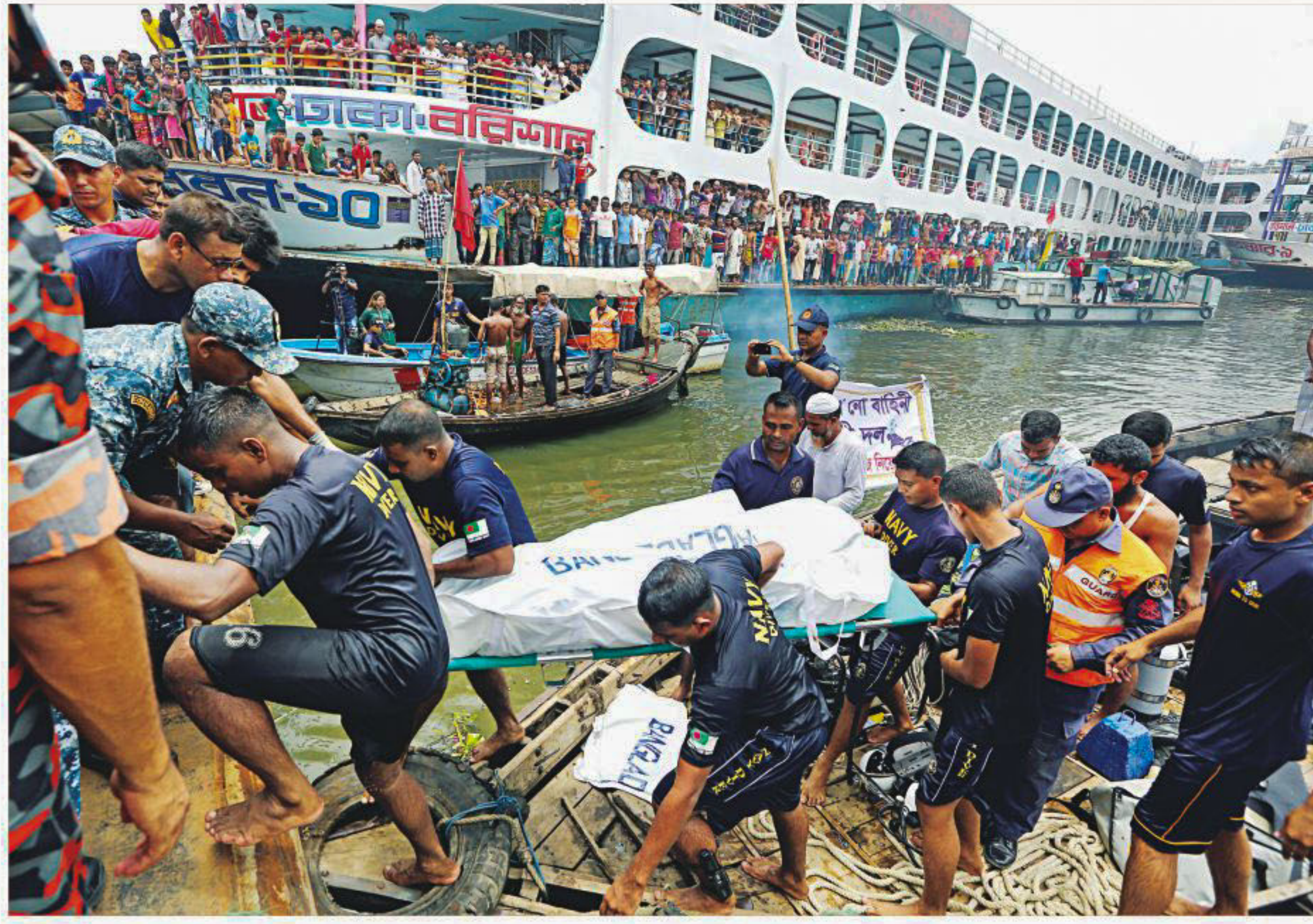
Navy divers recover the body of a child who along with his sibling drowned in the Buriganga around 7:00am yesterday after their boat capsized on way to Keraniganj from Sadarghat. The photo was taken near Sadarghat Launch Terminal in the city.