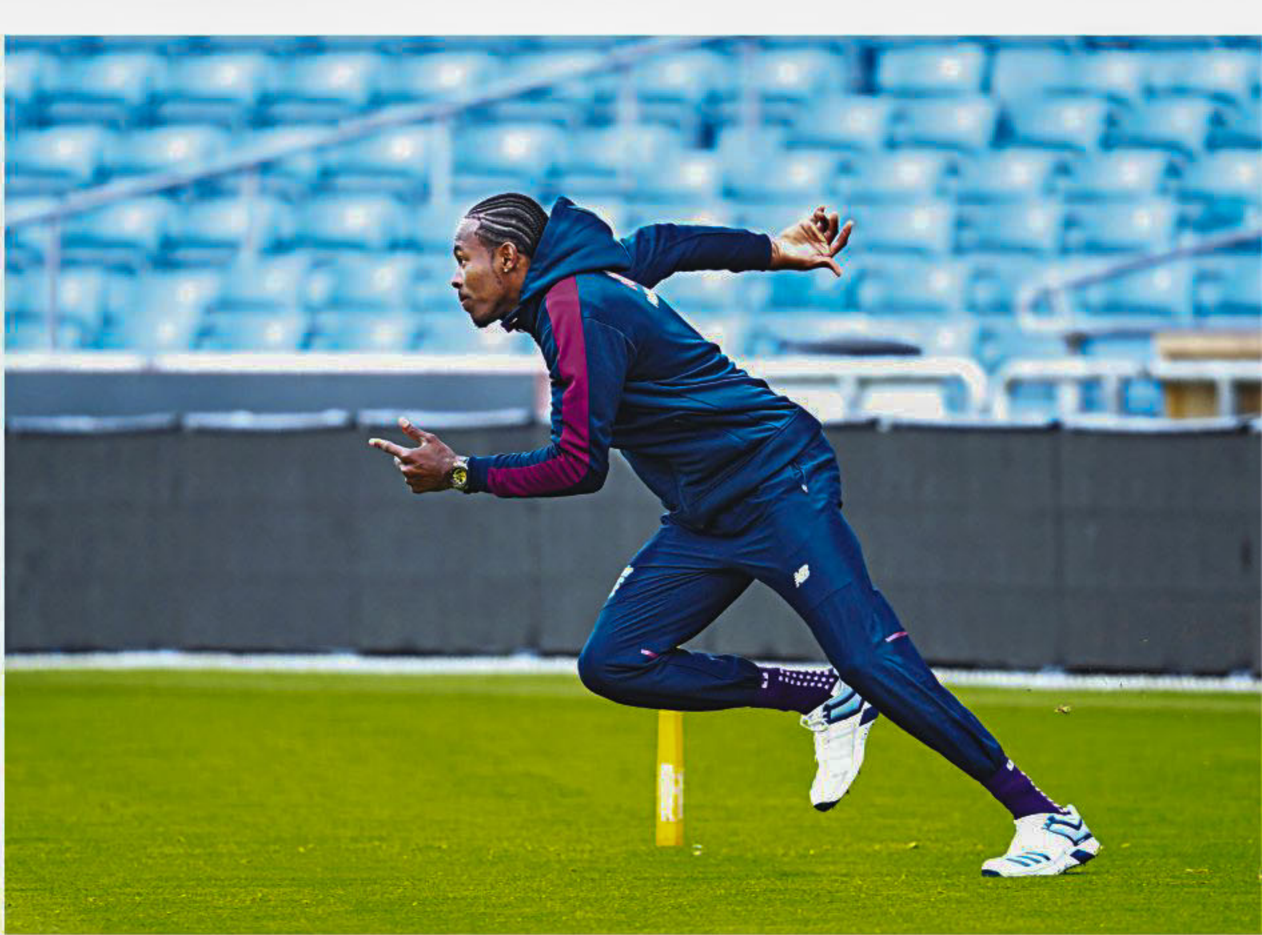
Sri Lanka captain Dimuth Karunaratne's 97 provided his side with a flying start against Australia in their previous World Cup match and he will be hoping for a similar effort with a different end result against England today. However, he will have to contend with the hosts spearhead, Jofra Archer, who has been going full tilt in the mega-event.