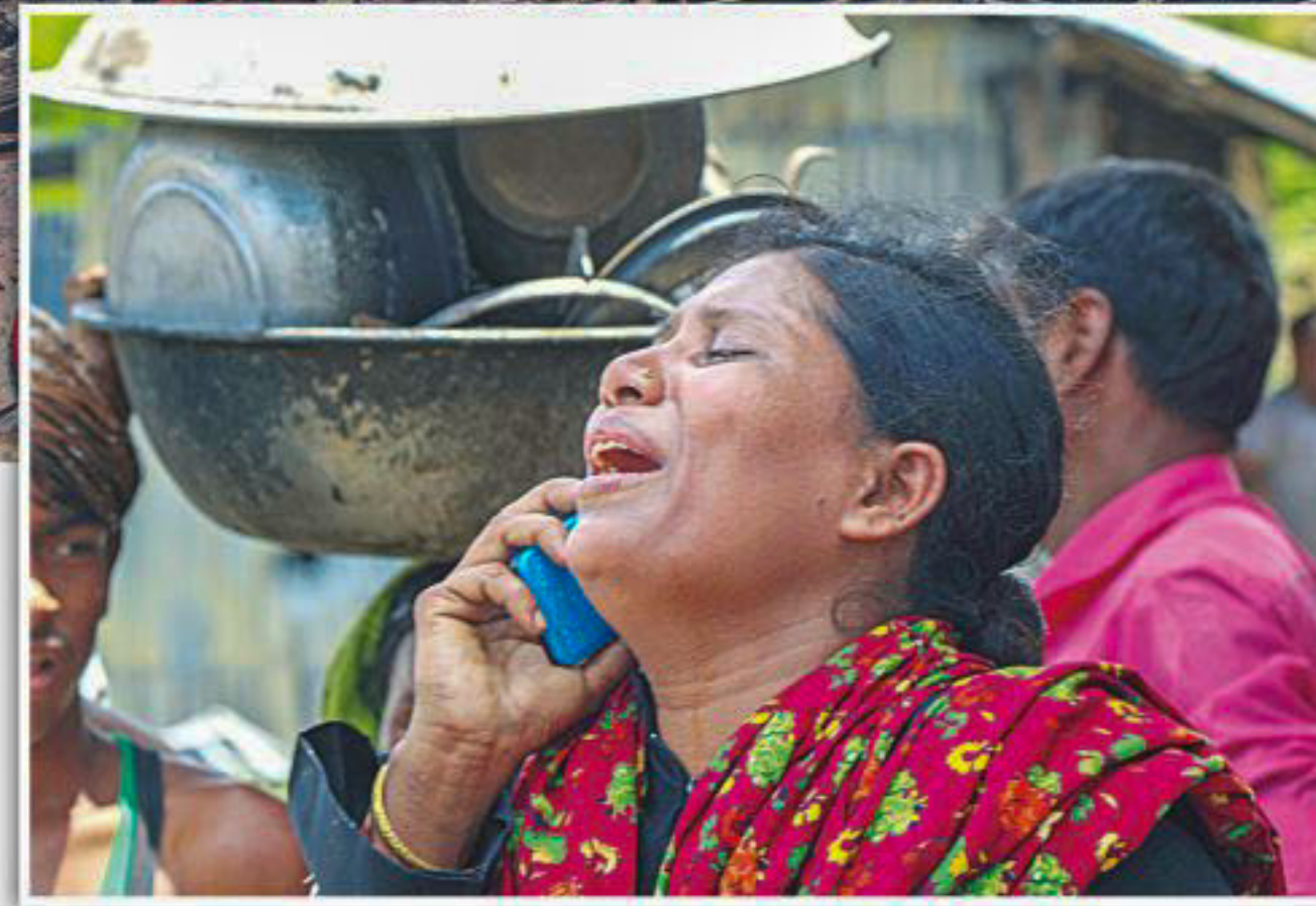
Firefighters spray water on burnt shanties after a fire broke out in a slum in Chattogram city's Chaktai area yesterday morning. Inset, a woman who lost everything in the flames wails while on the phone. Around 100 rooms were gutted in the incident.