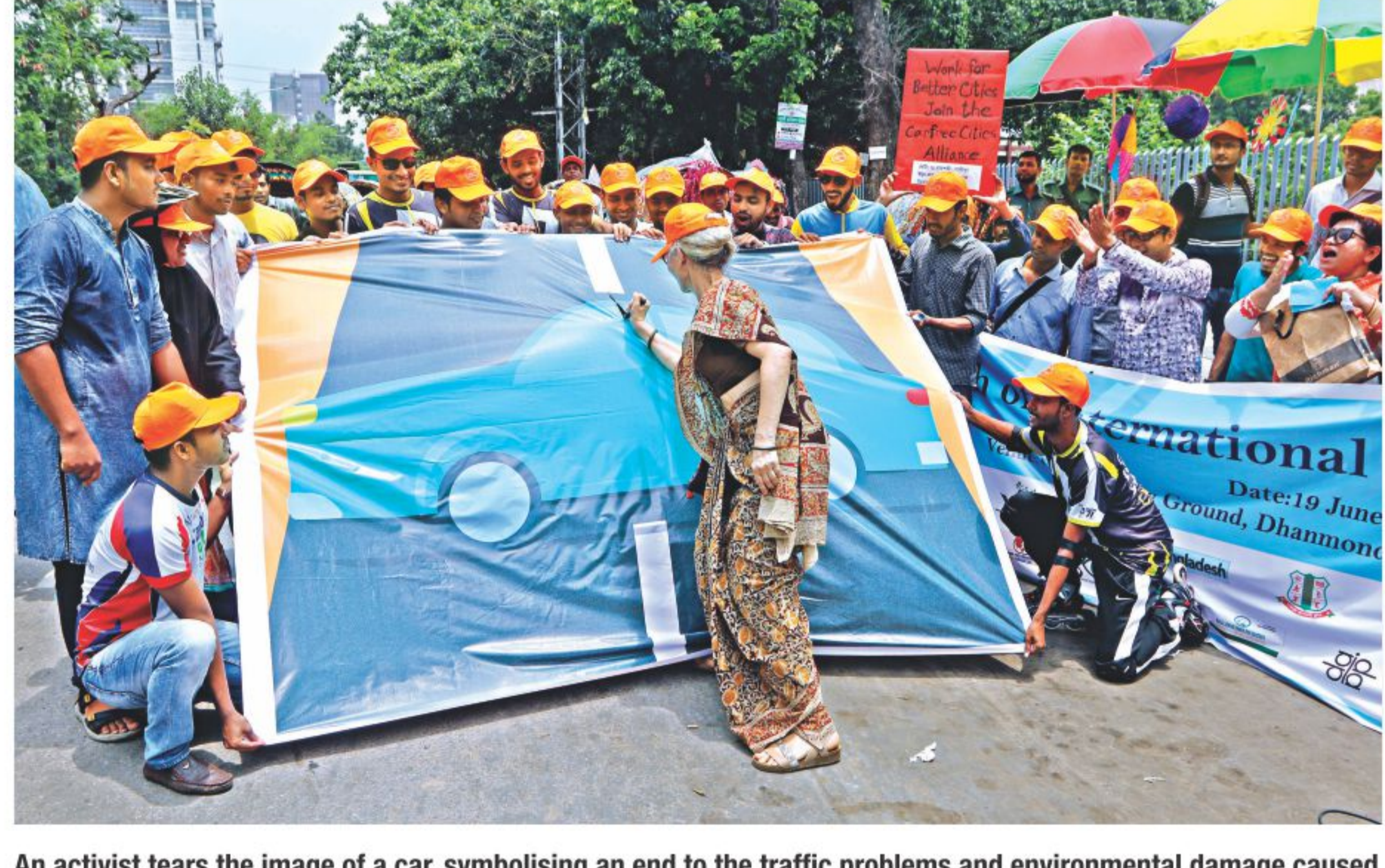
An activist tears the image of a car, symbolising an end to the traffic problems and environmental damage caused by the huge number of private vehicles roaming the streets of Dhaka. The photo was taken from Car-free Cities Alliance's inauguration programme on Satmasjid Road.