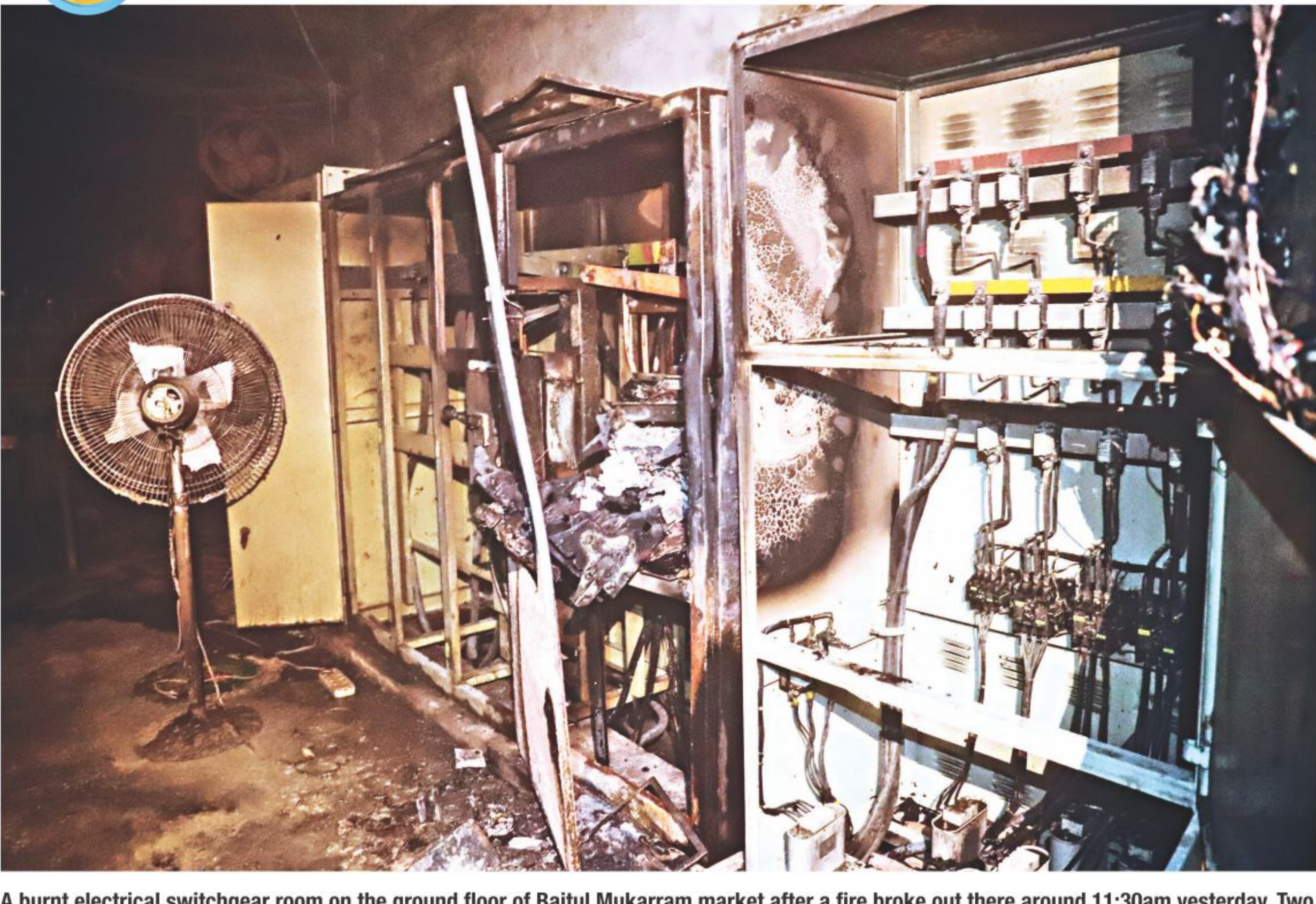
A burnt electrical switchgear room on the ground floor of Baitul Mukarram market after a fire broke out there around 11:30am yesterday. Two firefighting units rushed to the spot and doused the blaze within an hour. No casualty was reported.