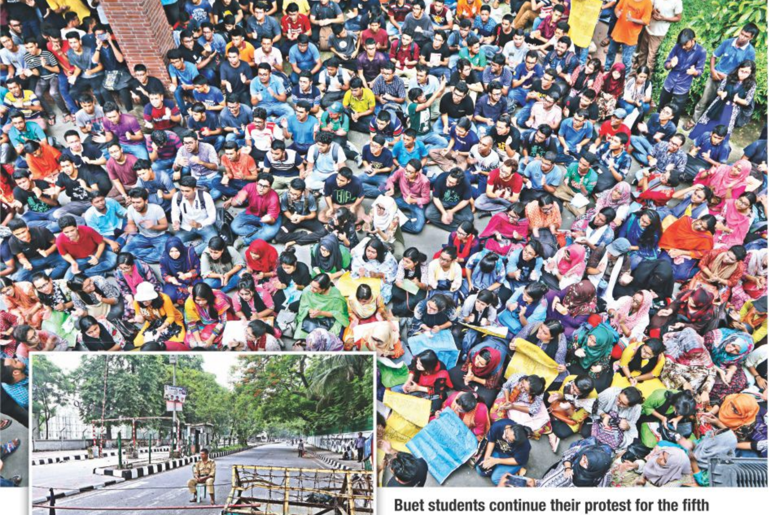
Buet students continue their protest for the fifth consecutive day, to press home their 16-point demand. Inset, roads entering the university were blocked during the demonstration.