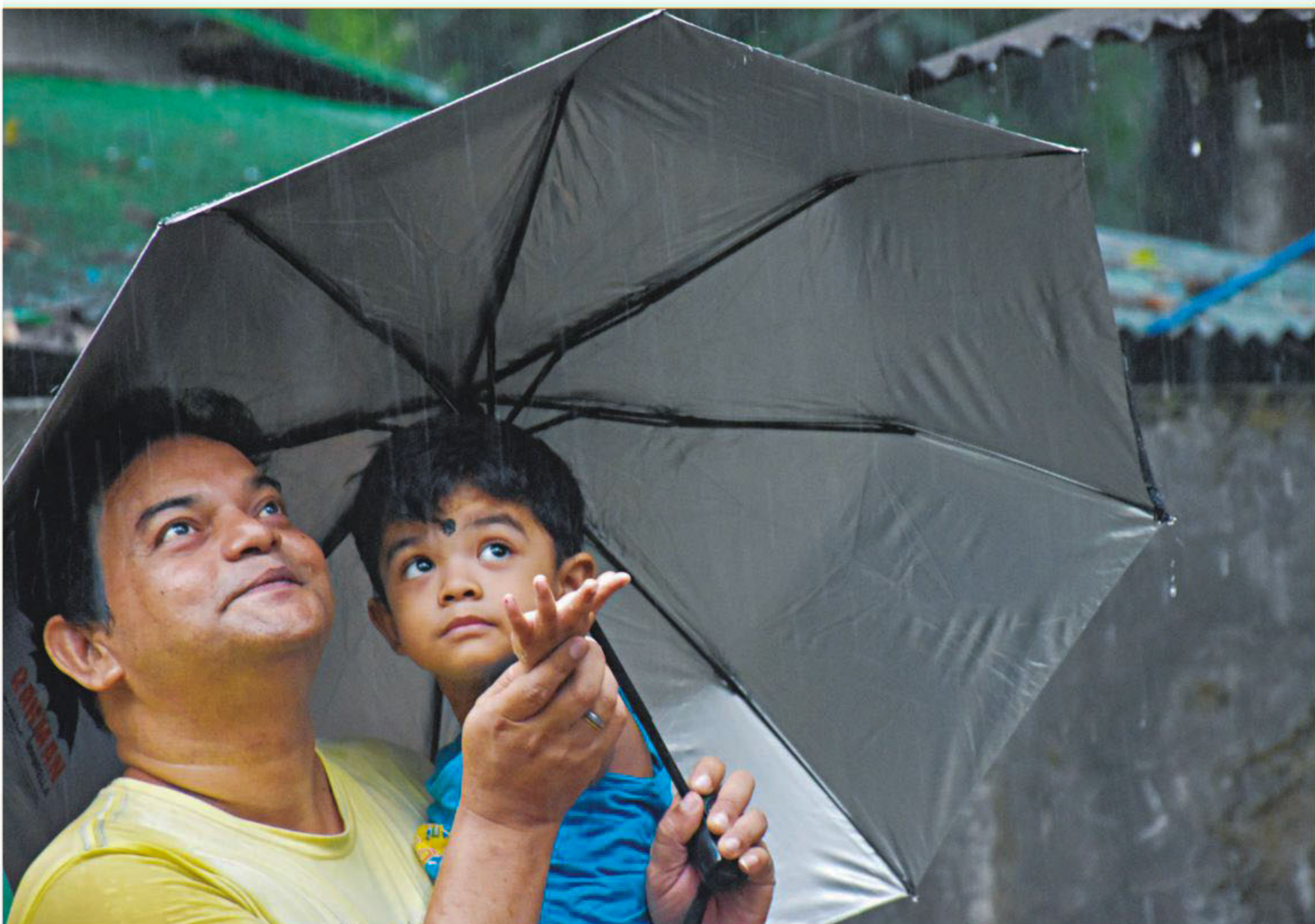
FATHER'S DAY TODAY... A father helps his child touch rain drops at Nazirpara of Barishal yesterday, the first day of the Bangla month Ashar which heralds the rainy season in Bangladesh.