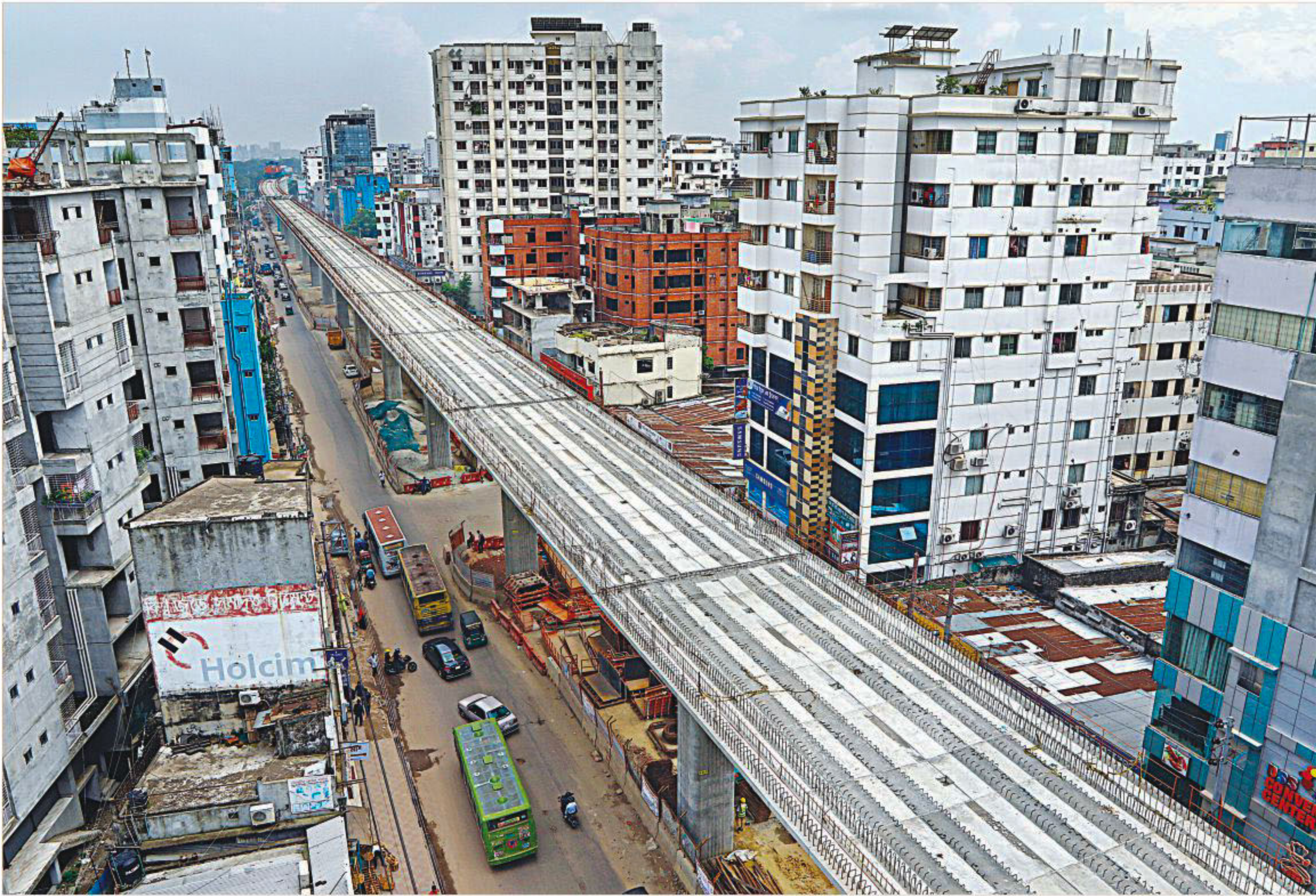
Progress of the construction of the country's maiden metro rail service is more visible in the capital's Shewrapara area than elsewhere. The city's perenni-al traffic congestion would partially ease once the construction of the metro lines is complete. The photo was taken on Tuesday.