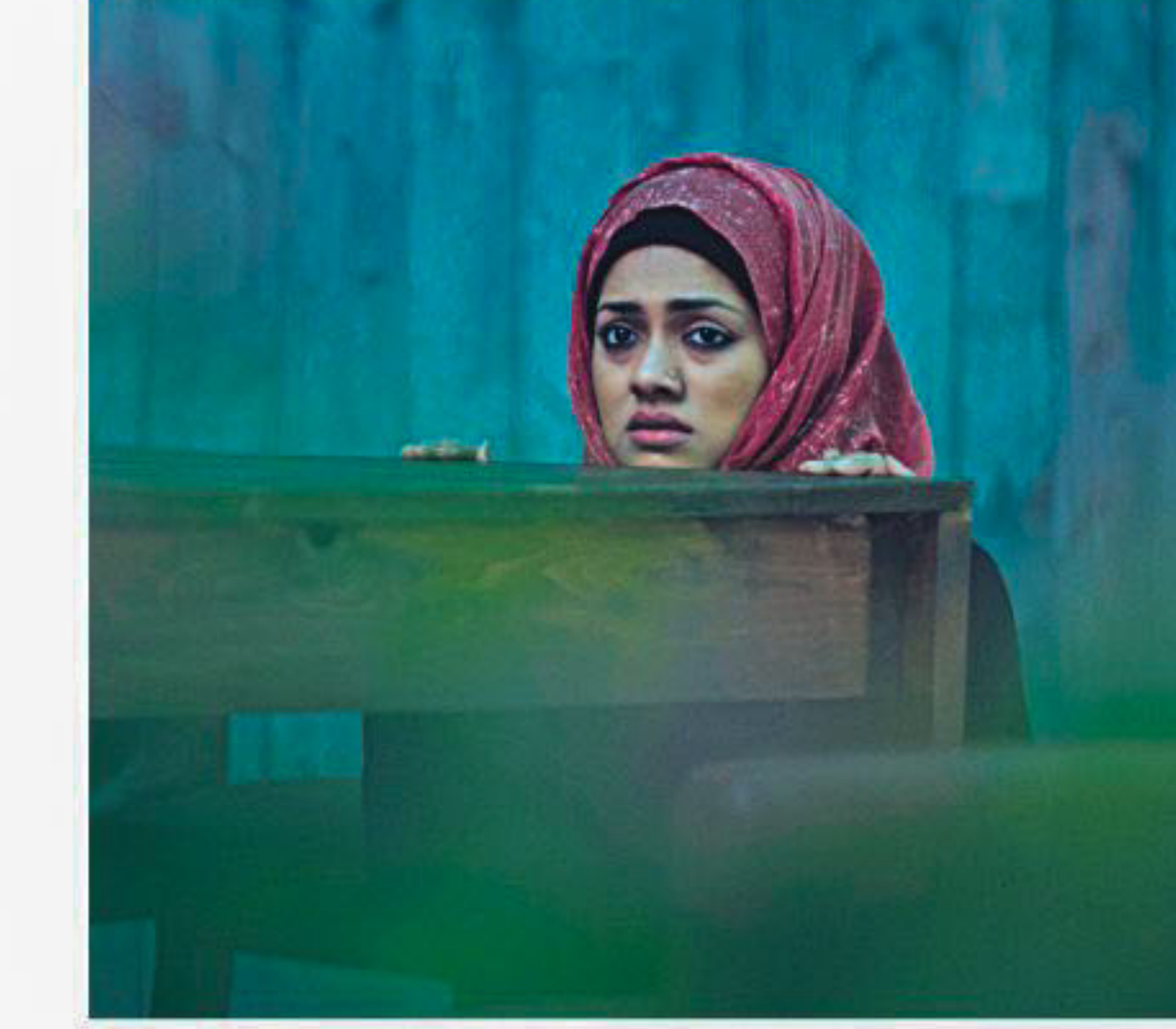
A still from 'Shonibar Bikel'.

After making successful rounds at international film festivals in Moscow and Sydney, Mostofa Sarwar Farooki's highly acclaimed directorial, 'Saturday Afternoon' or 'Shonibar Bikel', is now set to amaze audiences in Europe.