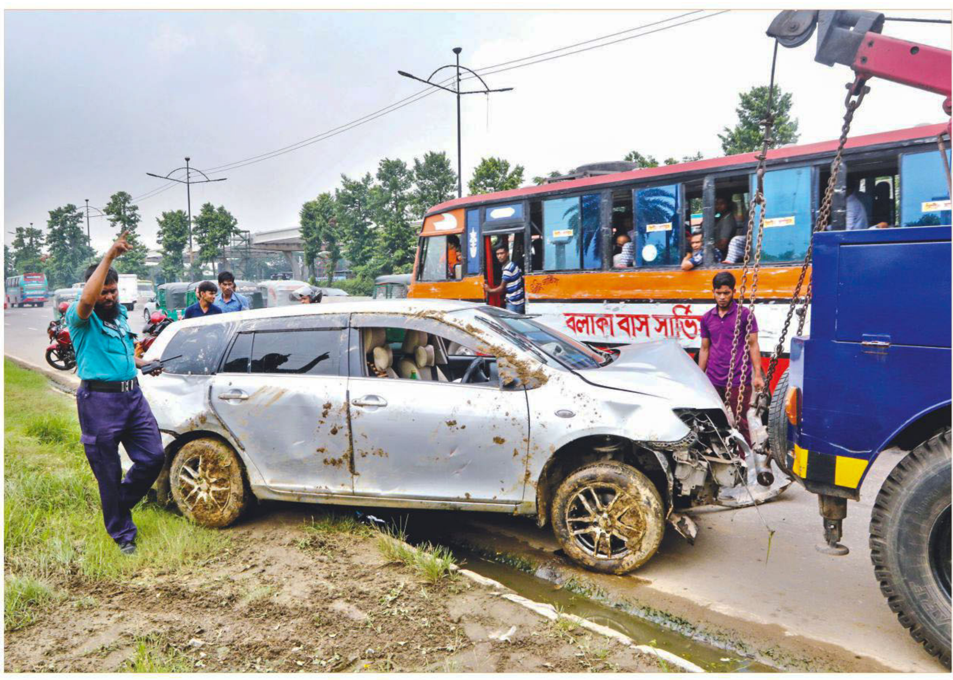
A tow truck pulls a damaged car after it was side-swiped by a bus on Airport Road in the capital yesterday.

A spokesman for the Israeli fire service said incendiary balloons from Gaza caused seven fires on Tuesday alone.