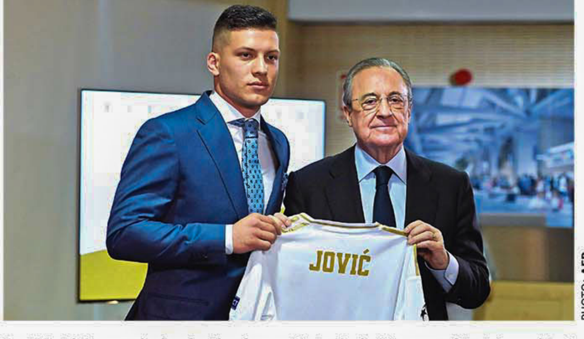
Real Madrid's new signing Serbian forward Luka Jovic (L) poses with club president Florentino Perez during his official presentation at the Bernabeu yesterday.