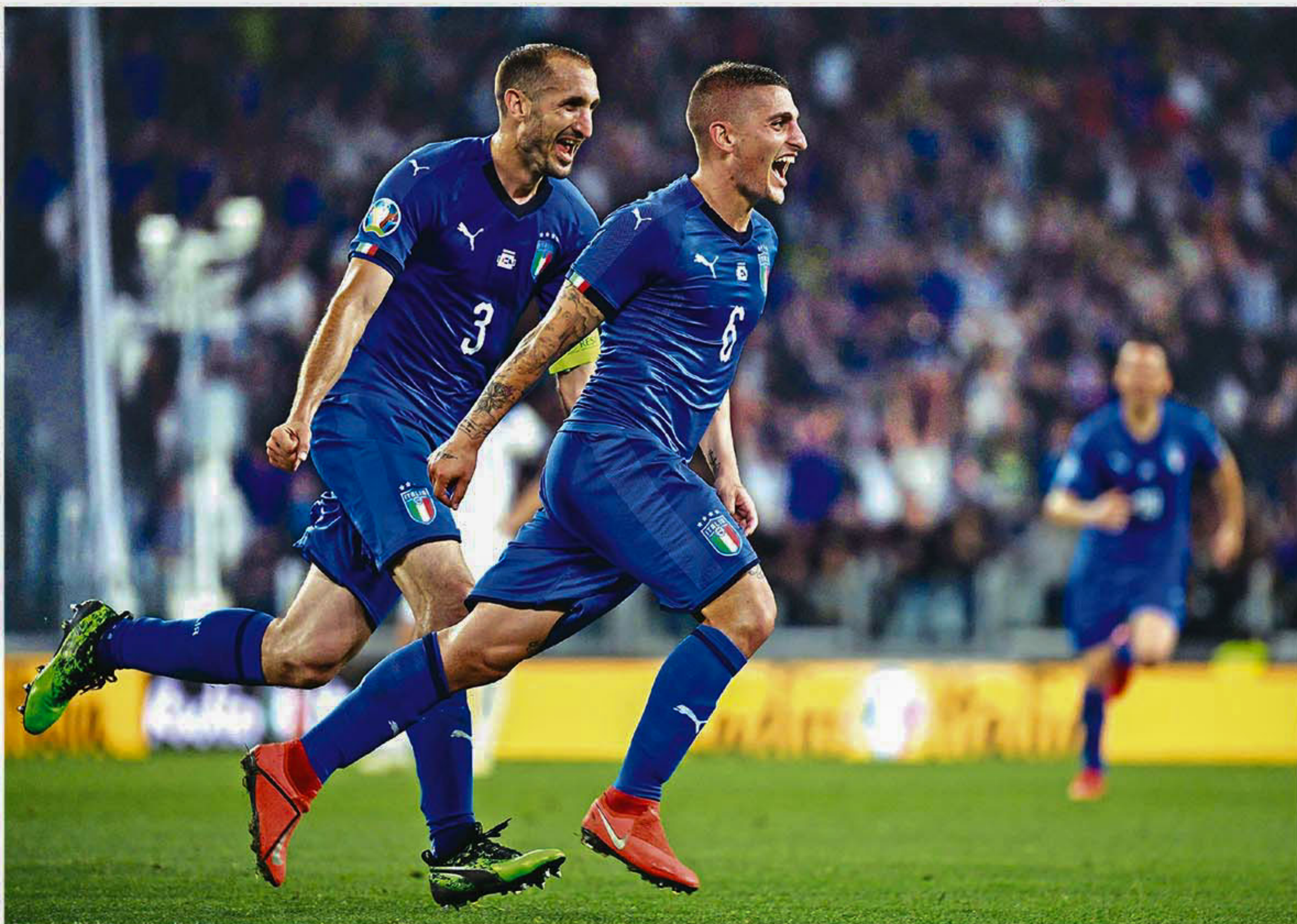
Italy midfielder Marco Verratti (R) celebrates his winning goal with teammate Giorgio Chiellini during their Euro 2020 Group J qualifier against Bosnia Herzegovina at the Allianz Stadium in Turin on Tuesday.