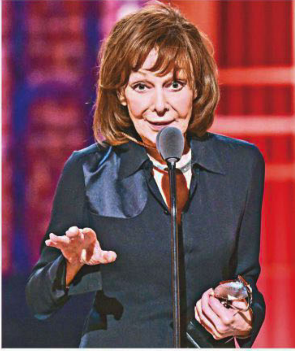
Elaine May accepts the award for best performance by an actress in a leading role in a play for 'The Waverly Gallery.'