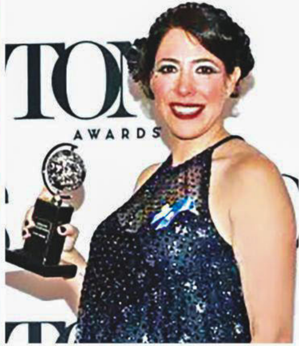
Rachel Chavkin with the award for best director of a musical for 'Hadestown.'