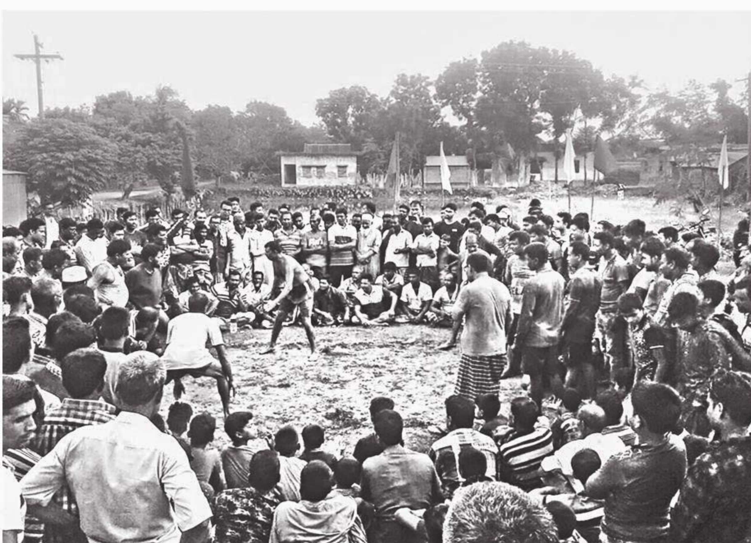
Two teams of players, one comprising men having one wife each, and the other having two wives each, vie for winning in a kabaddi game held at Amla in Mirpur upazila of Kushtia on Friday.