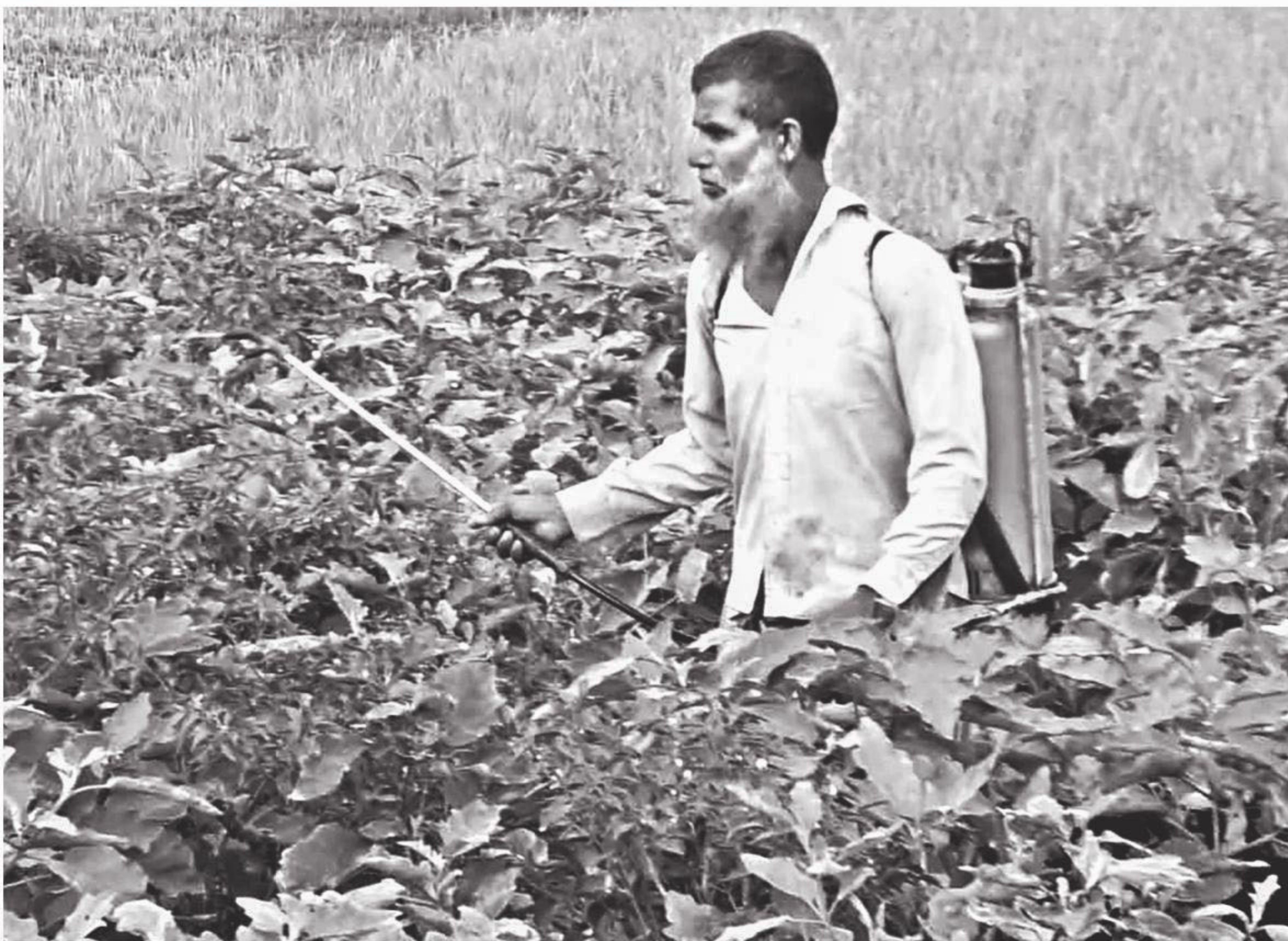
Hardly aware of the harmful effects, a farmer sprays pesticide at a crop field of Satitola village in Gobindaganj upazila of Gaibandha.