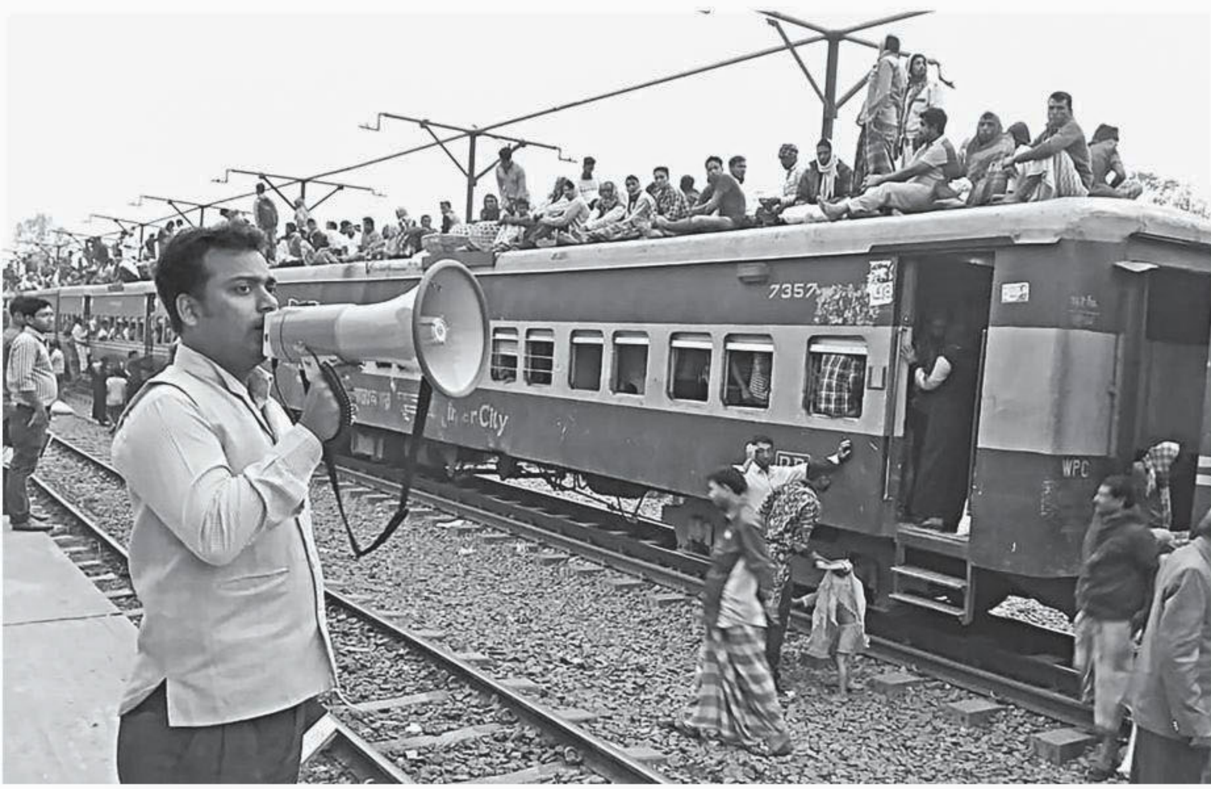
A volunteer urges passengers to keep safe distance from train at Joydevpur junction.