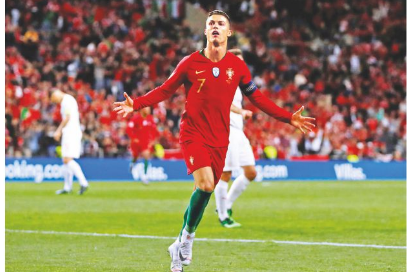
Portugal's inspirational skipper Cristiano Ronaldo celebrates his hat-trick against Switzerland during the semifinal of UEFA Nations League in Estadio do Dragao in Porto on Wednesday.

Depay particularly wasteful in front of goal. However, the introduction off the bench of Promes and Donny van de Beek offered the Netherlands more dynamism and England were eventually punished for sitting deep when De Ligt made amends by powering home from a corner. Van de Beek then missed a glorious chance to completely turn the game around. Yet, just when there seemed only one winner, England produced their best move of the game as Stones, Ben Chilwell, Barkley and Raheem Sterling moved the ball from one end to the other before Lingard slotted home.