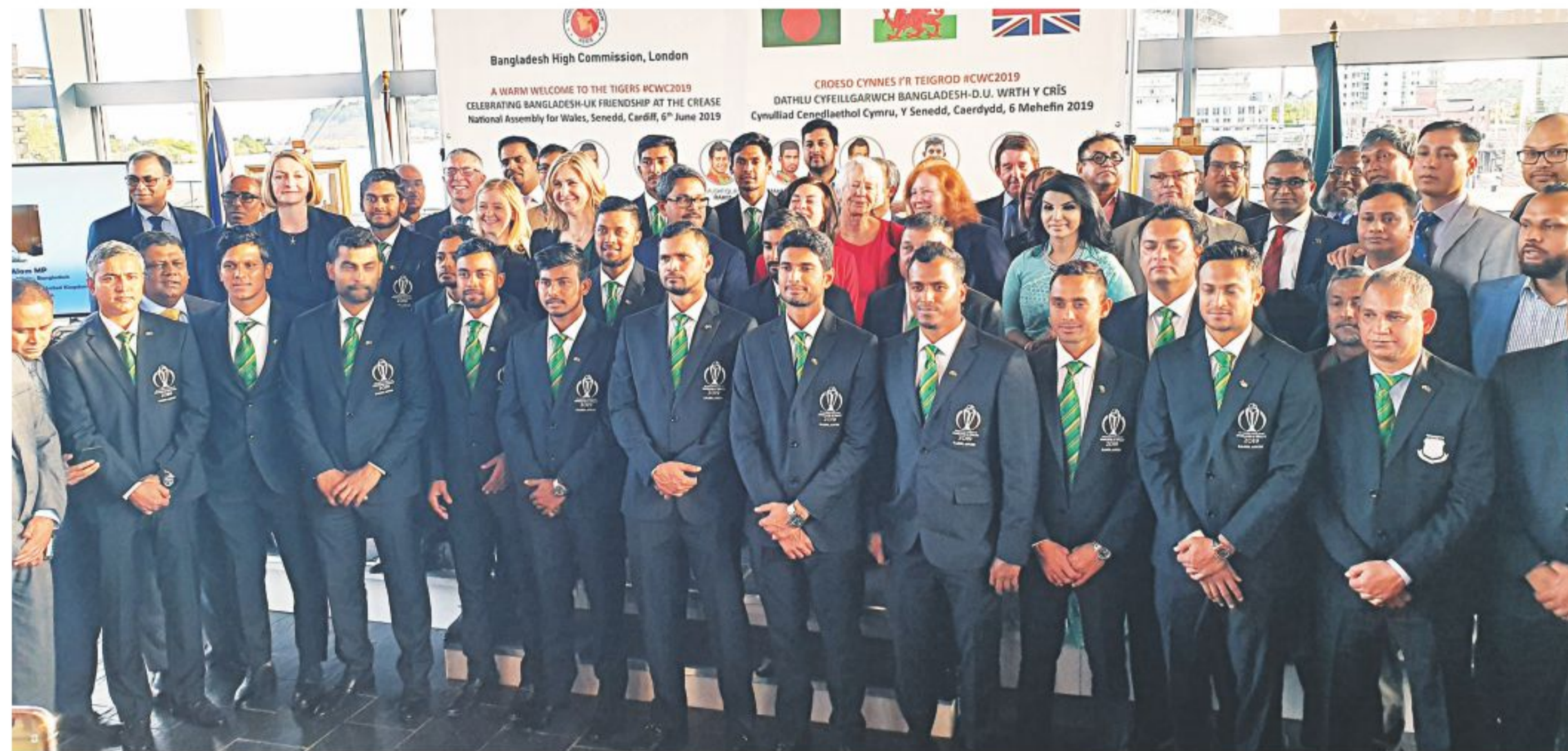
After a defeat to New Zealand had somewhat dampened the mood in the Bangladesh camp, the Tigers were picked up by a reception hosted by Bangladesh's high commissioner to the UK, Saida Muna Tasneem, on Thursday.

elected member of parliament -- which the high commissioner mentioned in her speech -- the state minister for foreign affairs said that he hoped that the Bangladesh skipper would not be available for the tournament, as it would mean that Bangladesh would have exited before the semifinals.