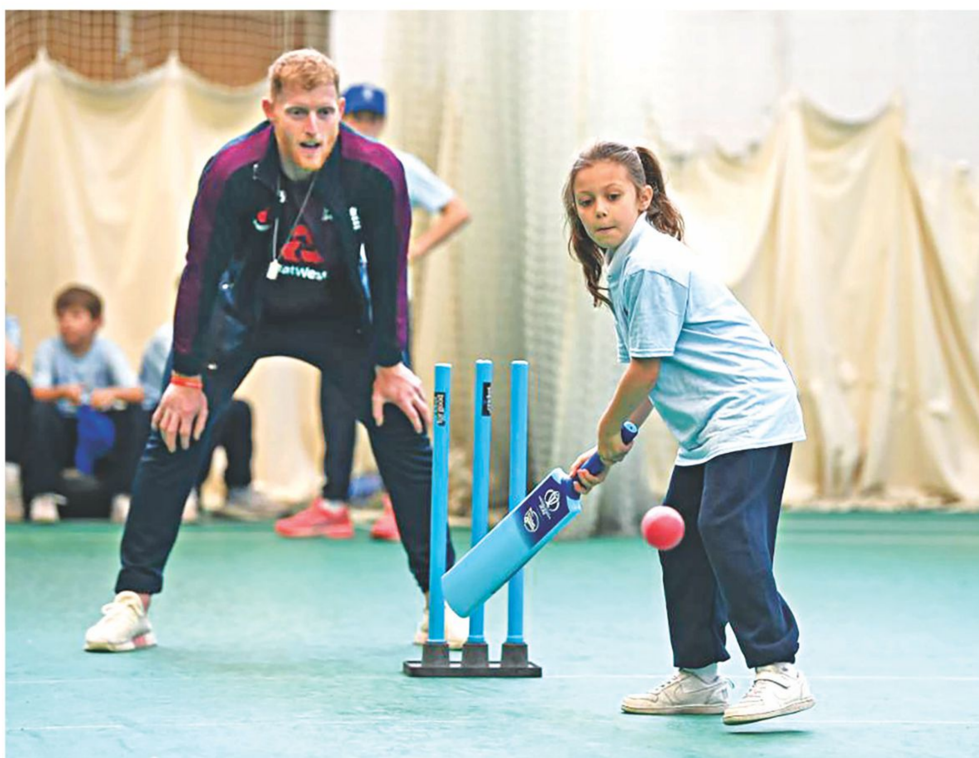
Ahead of training yesterday, some of the players of the England team, including all-rounder Ben Stokes and bowlers Jofra Archer and Mark Wood, helped run a coaching clinic for Cricket for Good -- the ICC's global community outreach programme. Here, Stokes keeps wickets and comments on a little girl's impressive batting technique.

The 27-year-old had an lbw shout against Shai Hope turned down before near-misses from both Hope and Shimron Hetmyer. Hetmyer and Jason Holder then hit him for consecutive fours as he switched bowling ends in the lead-in to the outburst.