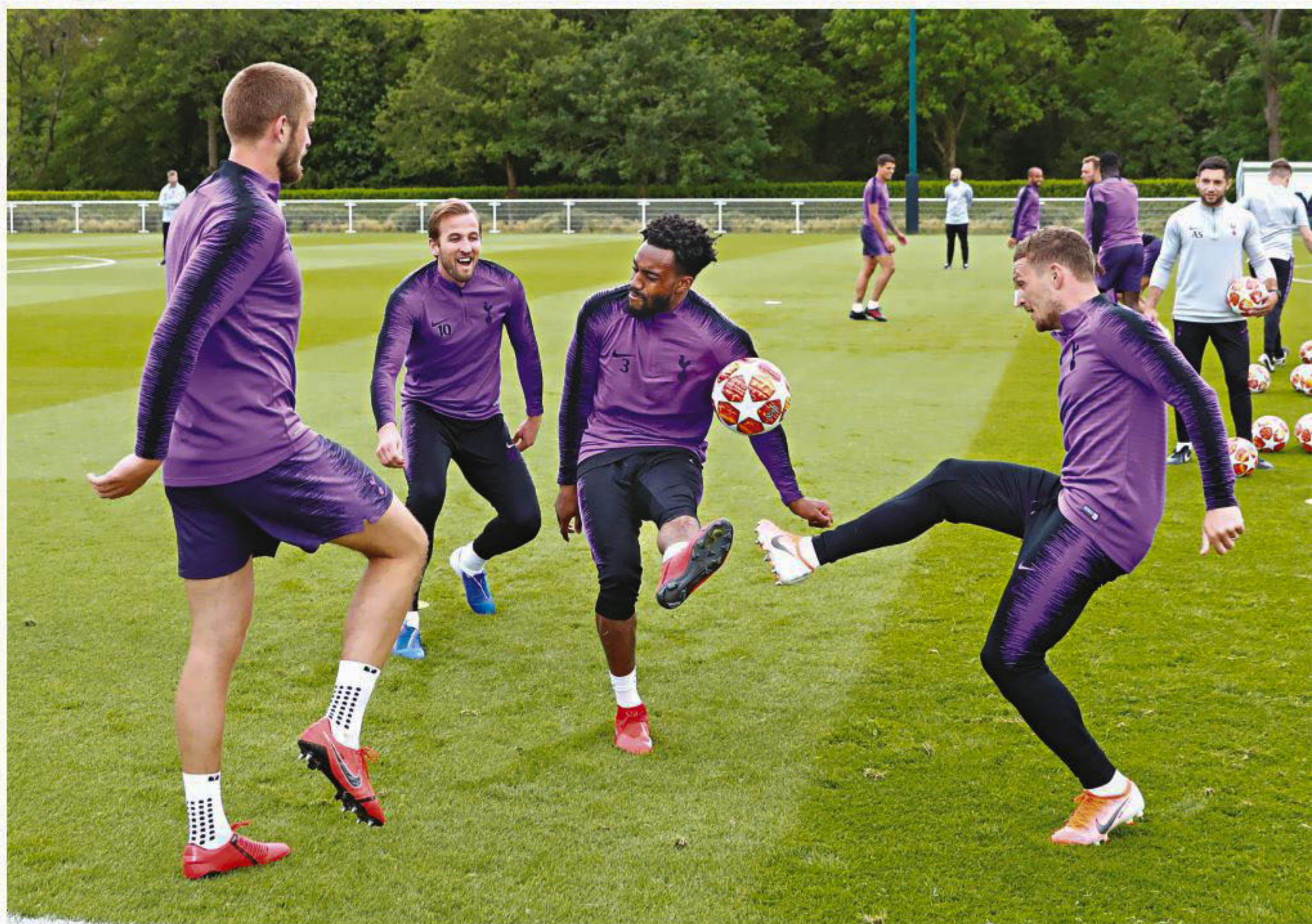
Both the Liverpool and Tottenham squads were hard at work yesterday, gearing up for what should be a sensational clash between the sides in the UEFA Champions League final tonight. This will be the second time Liverpool coach Jurgen Klopp will have a go at the title while it will be the first for Tottenham coach Mauricio Pochettino.