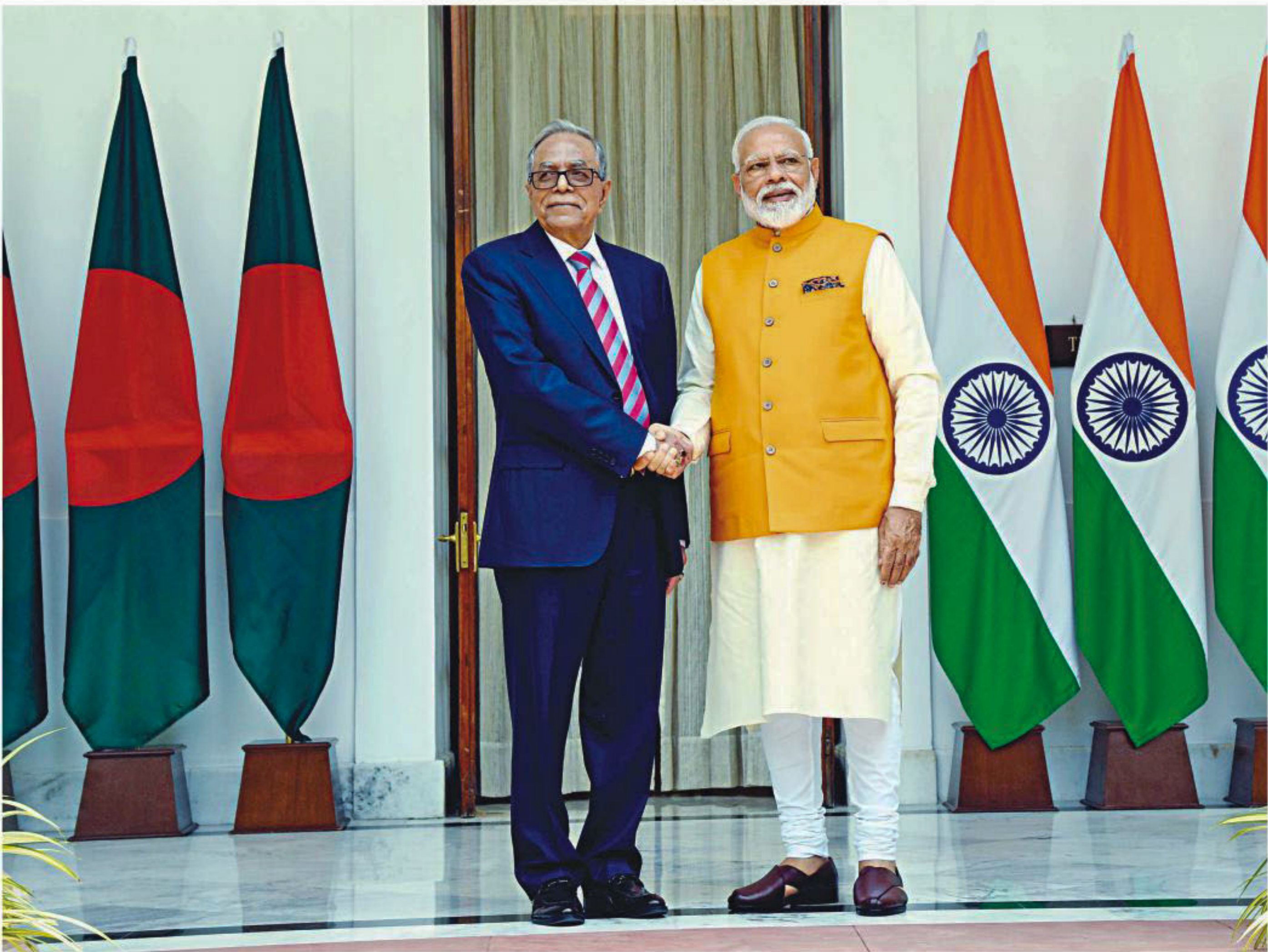
President Abdul Hamid meets Indian Prime Minister Narendra Modi at the Hyderabad House in New Delhi yesterday. The president visited India to attend the swearing-in ceremony of the Indian premier.