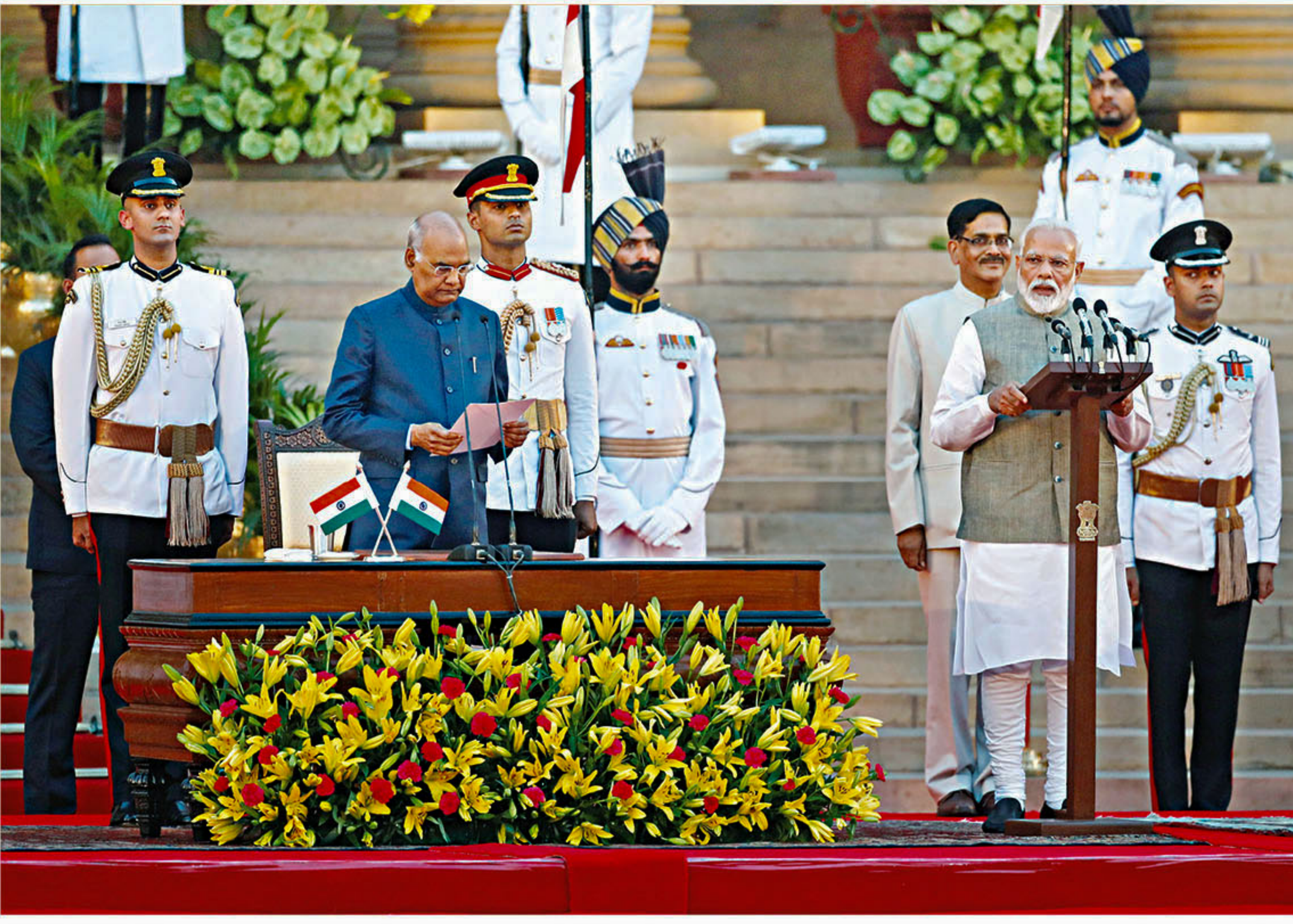
India's President Ram Nath Kovind administers oath of India's Prime Minister Narendra Modi during a swearing-in ceremony at the presidential palace in New Delhi, India, yesterday.

STAFF CORRESPONDENT With an unofficial holiday of over a week beginning today, thousands of city dwellers started leaving the capital yesterday for their homes to celebrate Eid-ul-Fitr. Bus terminals, railway stations and launch terminals were crowded with homebound people yesterday. The rush, however, is expected to intensify today and is expected to reach its peak two days before Eid. Although the three-day public holiday will begin from Tuesday (May 4), a large number of government and non-government service holders left Dhaka yesterday, taking a leave for the only working day on Monday before the Eid, securing a nine-day holiday at a stretch. Eid is likely to be celebrated on June 5. Due to the long vacation, home-goers' trips are likely to be a little comfortable this year. Besides, most highways are in better condition while new bridges and flyovers have opened to public. A good number of home-goers left Dhaka city yesterday through different trains, though some of those ran behind schedule. Passengers had to wait half an hour to over two hours at the Kamalapur Railway Station due to delays. Among the trains, Chilahati-bound Nilsagar Express was delayed by more than two hours, while the newly launched Rajshahi-bound Banalata Express left Kamalapur around 30 minutes after schedule. The Chattogram-bound SEE PAGE 9 COL 1