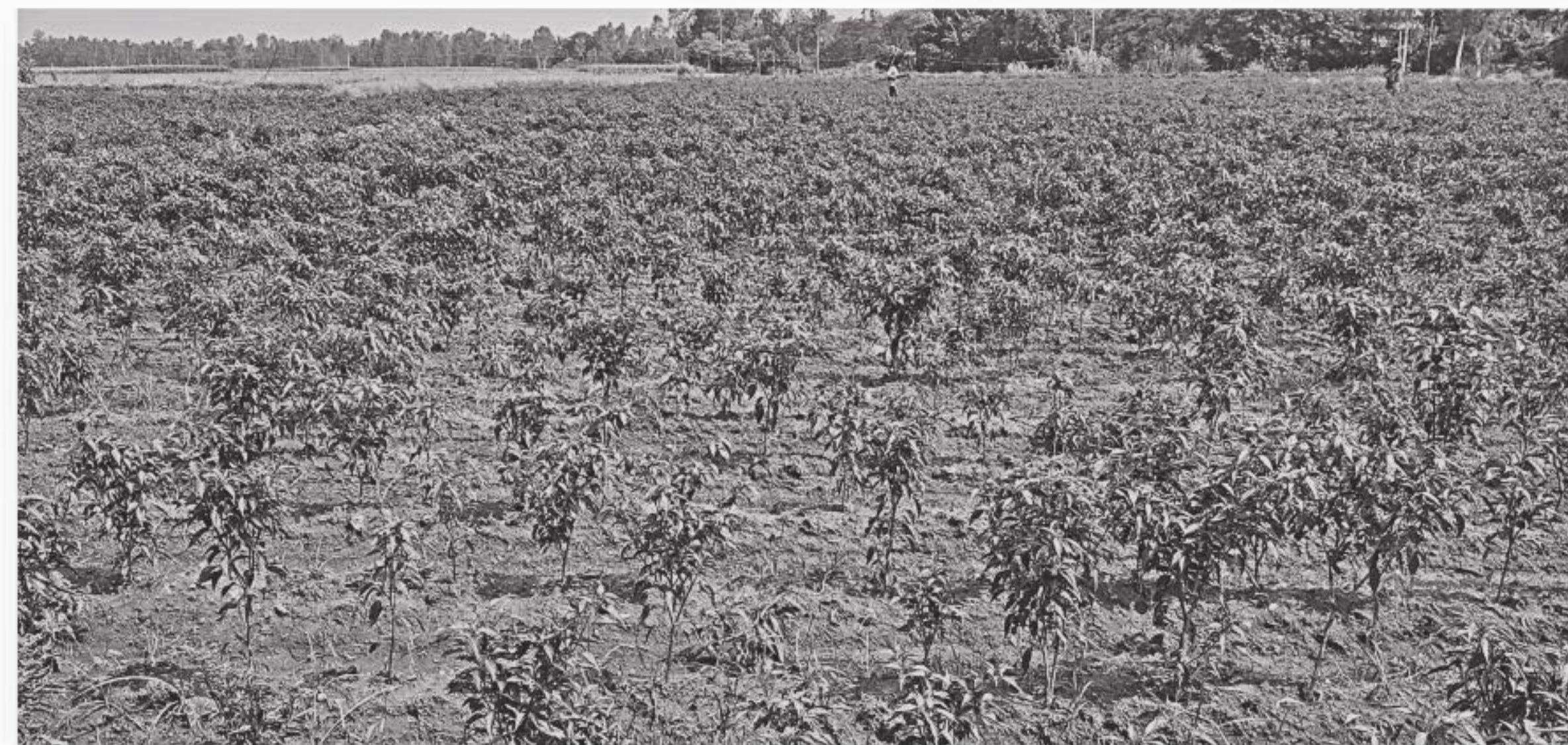
As in many other areas of Manikganj, chilli plants at a field of Shimulia village in Shivalaya upazila gives much less than expected yield this season, as the region famous for high quality chilli witnessed a hot and dry weather.

It is difficult to recover even the cultivation cost although the chilli price has risen to about Tk 30 per kg, from Tk 15 in last season, he said.