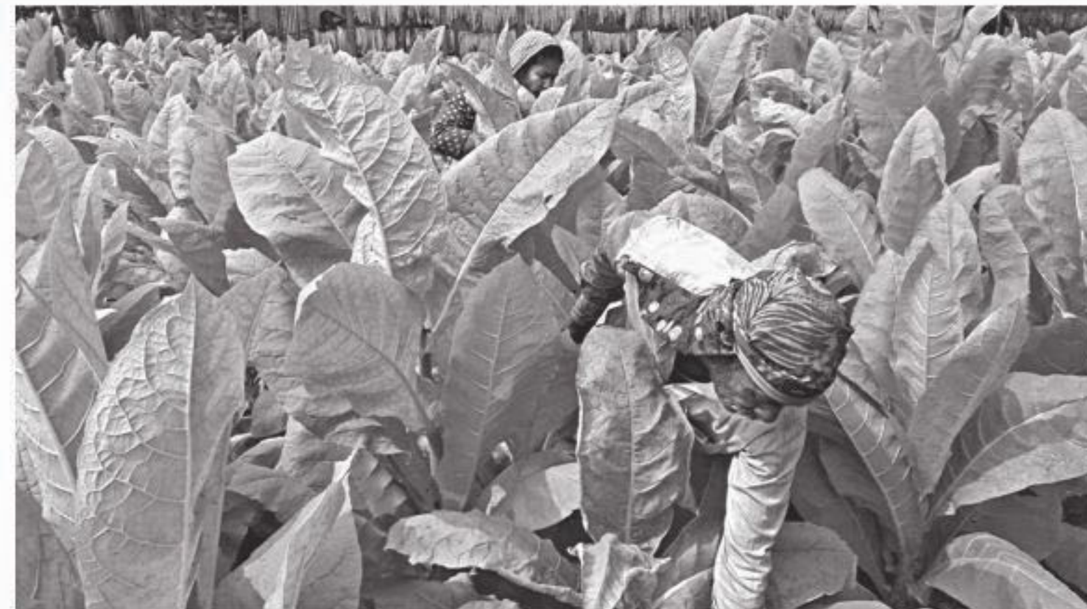
Two schoolgirls hold their noses as a huge quantity of tobacco leaves hung along a road at Bhadai village in Lalmonirhat's Aditmari upazila spread a bad odour. Below left, children are engaged in processing tobacco leaves at a warehouse at Saralkhan village in the same upazila and right, a farmer couple tend their tobacco field at Karnapir village in Lalmonirhat Sadar upazila.