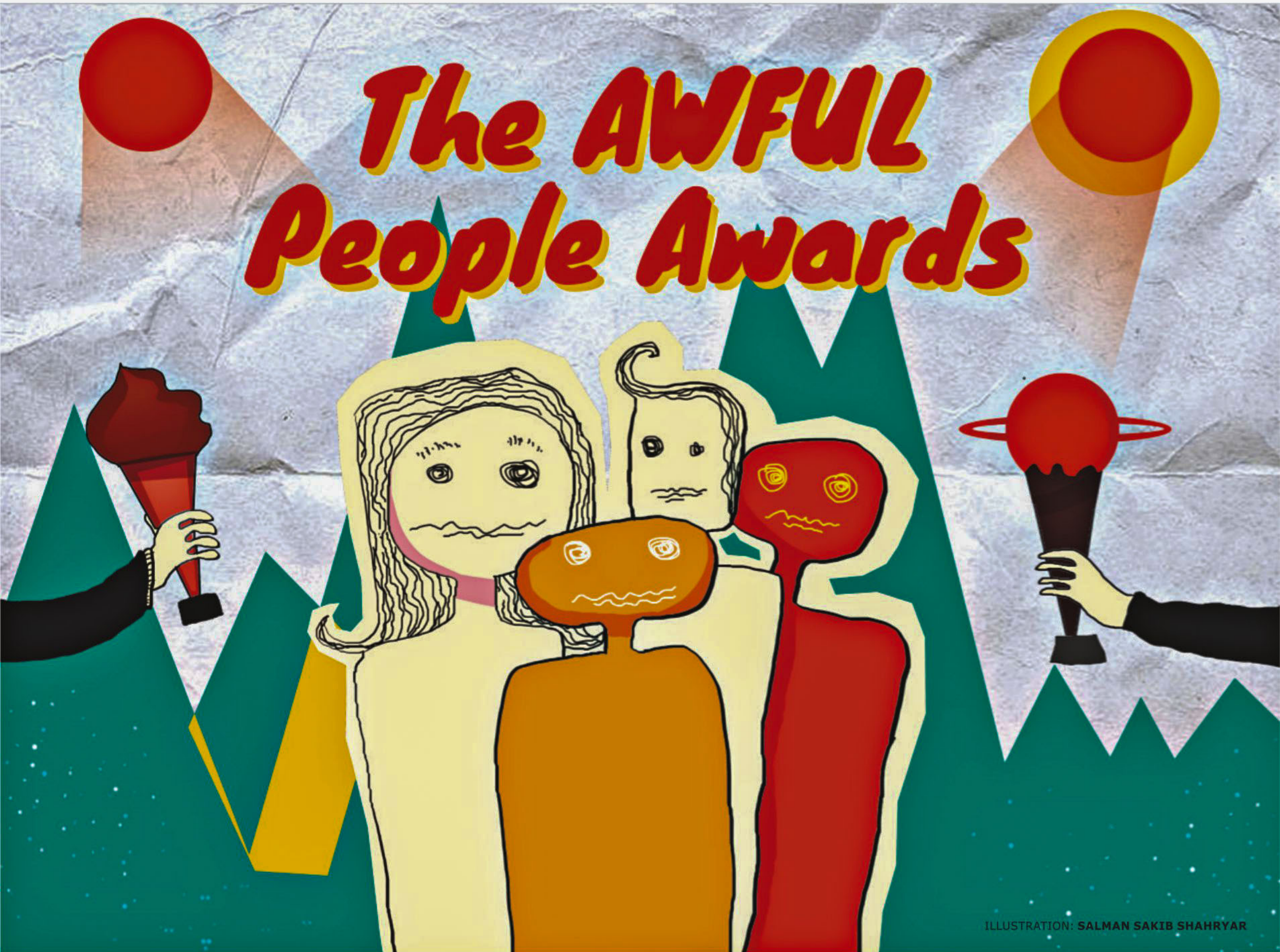
ILLUSTRATION: SALMAN SAKIB SHAHRYAR