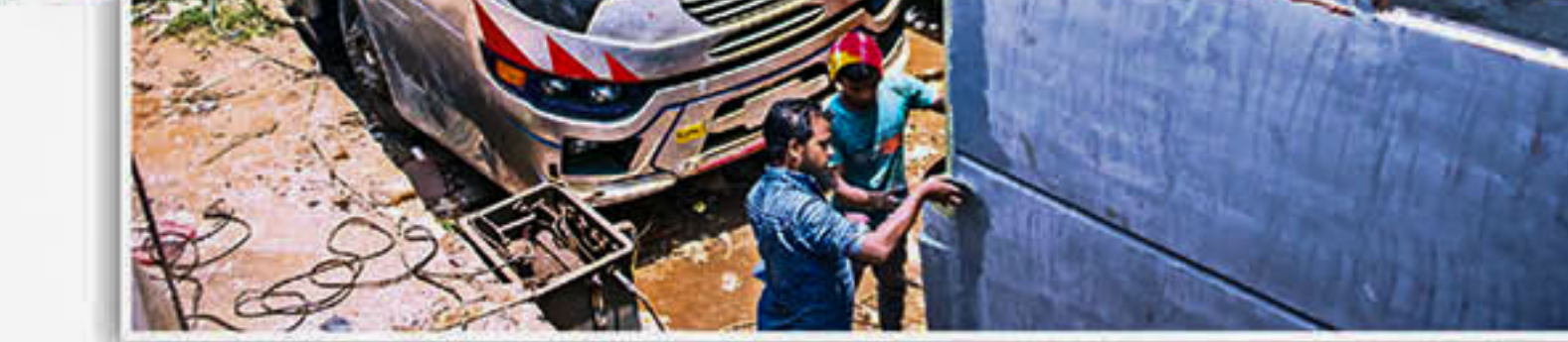
UP TO THEIR OLD TRICKS... Workers give an old bus a facelift so that the unfit vehicle could carry passengers during the Eid rush. Such vehicles, inset, often get involved in fatal crashes on highways. The photos were taken at a workshop in Gabtoli yesterday.