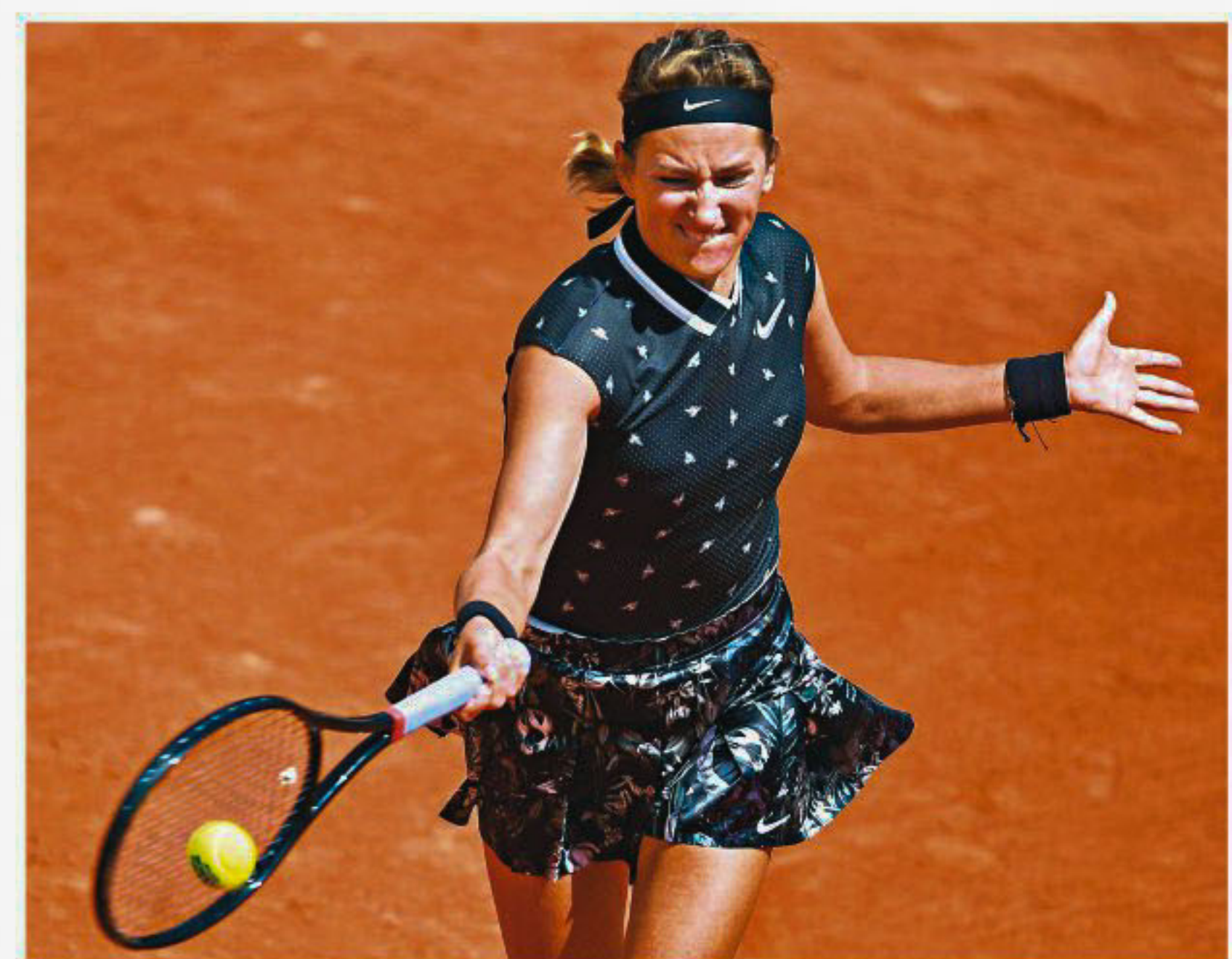
Victoria Azarenka hits a forehand return against Jelena Ostapenko during their women's singles first round match of the French Open in Paris on Tuesday.

Canada's Bianca Andreescu, the surprise champion at Indian Wells, marked her Roland Garros debut by beating Marie Bouzkova of the Czech Republic 5-7, 6-4, 6-4.