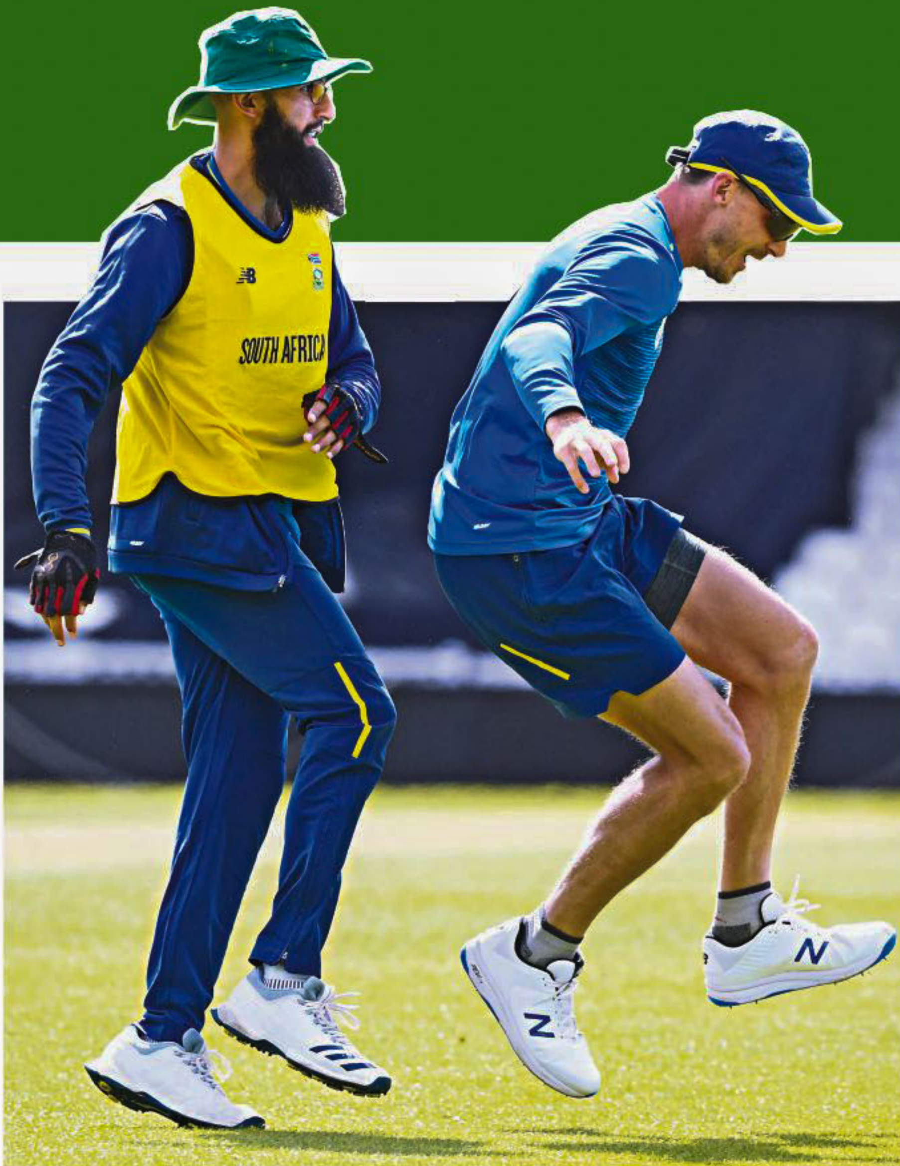
South Africa batsman Hashim Amla (L) and bowler Dale Steyn run some drills during a training session at The Oval yesterday. South Africa will face England in the ICC Cricket World Cup opener at the same venue tomorrow.

Steyn has not bowled competitively since pulling out of Royal Challengers Bangalore's IPL campaign in late April, having played only two games there.