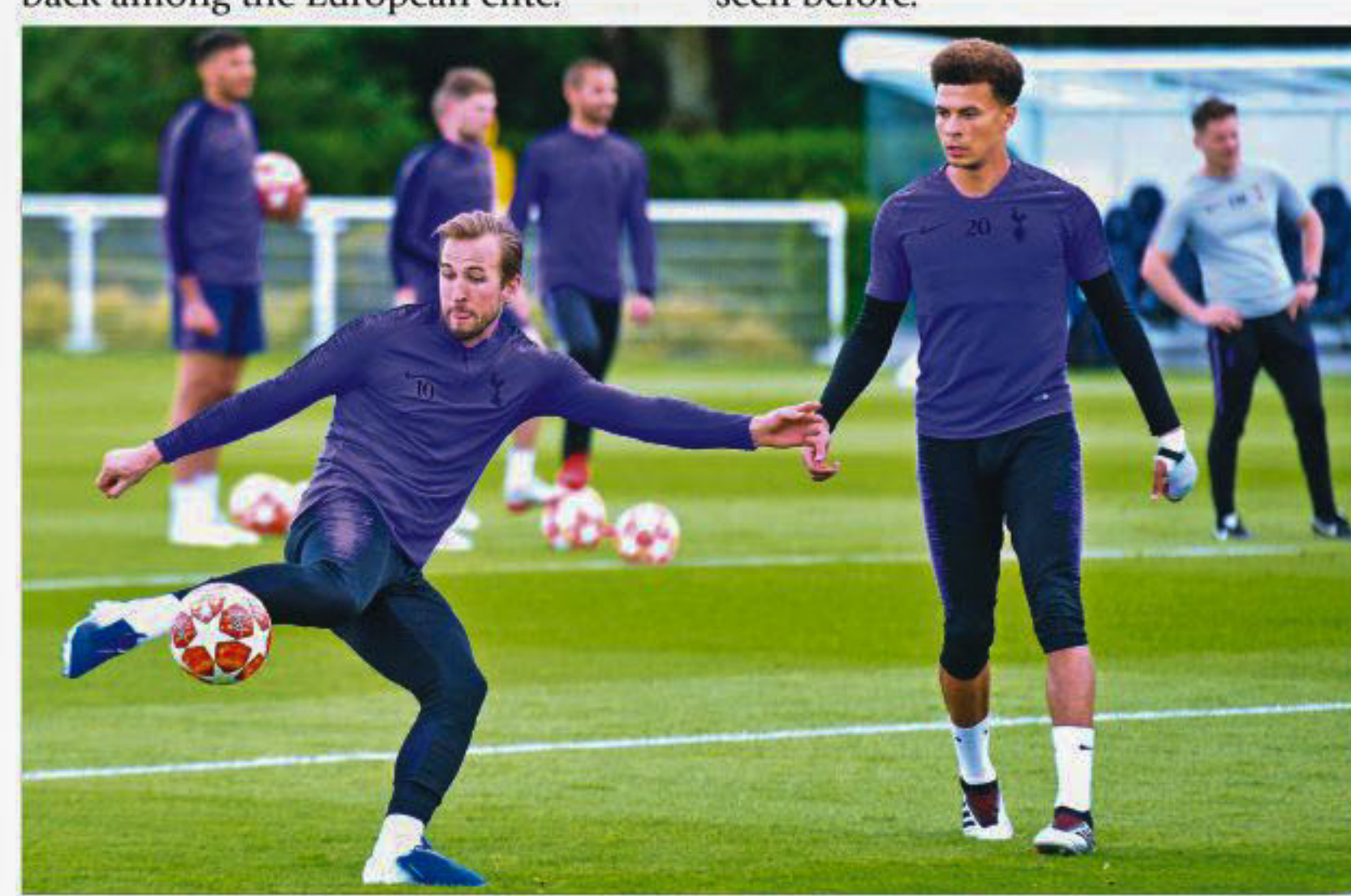
Tottenham Hotspur striker Harry Kane (L) practises a volley during a training session at Enfield Training Centre in London on Monday ahead of their Champions League Final against Liverpool on Saturday.

Saturday's meeting in Madrid is his last chance to deliver on that confidence. But even if he loses, Klopp will still be revered rather than relieved of his duties for putting Liverpool back among the European elite.