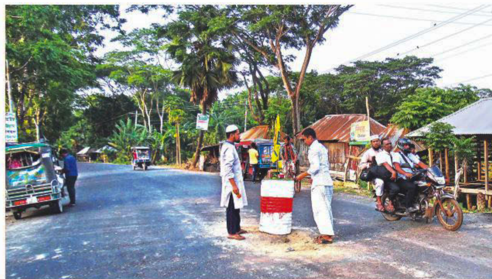
Locals voluntarily set up a drum with a flag on it on an unmarked speed breaker on Barishal-Khulna highway to warn the approaching vehicles. The photo was taken in Pingri area of Rajapur in Jhalakathi recently.

During Eid, passenger vehicles are generally overcrowded, while a lot of unfit vehicles are often driven by