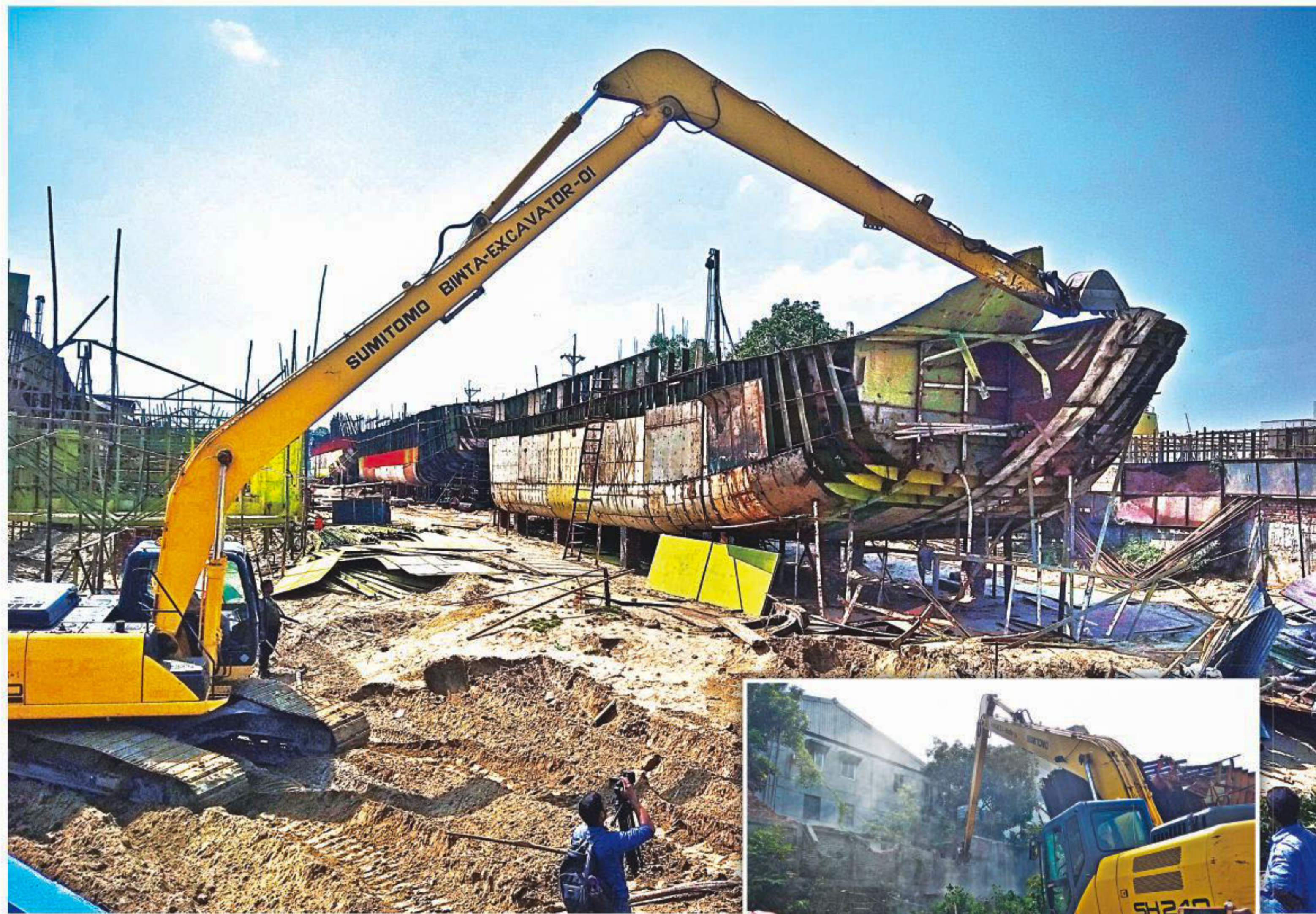
BIWTA knocks down a dockyard, built illegally in the Meghna river in Sonargaon yesterday. The eviction team also dismantled boundary walls of a building, inset, on the fifth day of its ongoing drive.

Besides, the owners were ordered to keep the factory closed until effective implementation of ETP.