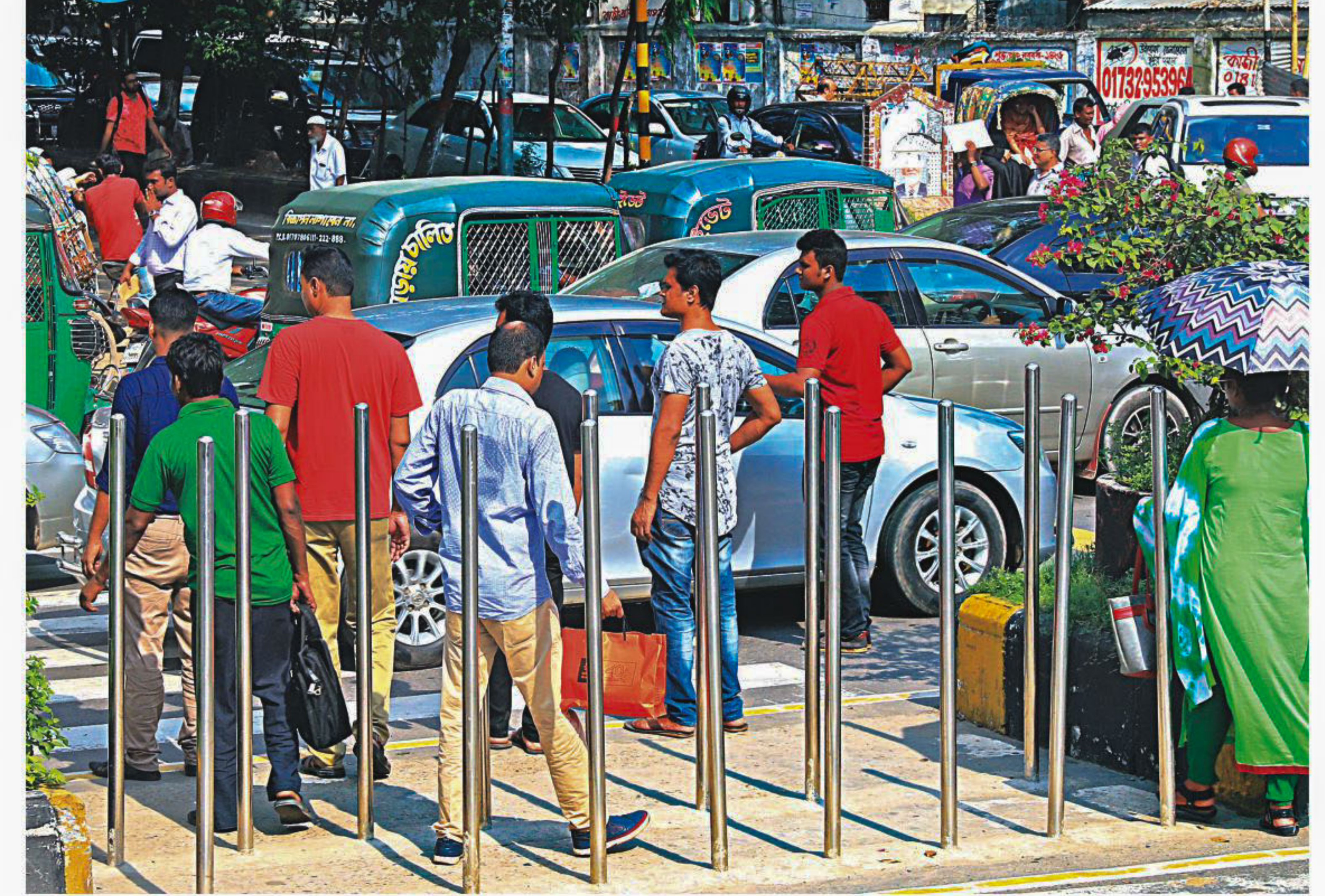
AT THE COST OF PEDESTRIANS ... This road median at Matsya Bhaban intersection connects the zebra crossings on two sides of the road, but metal barriers -- set up here to prevent motorbikers from crossing through the walkway -- defeats the purpose of smooth pedestrian crossing.