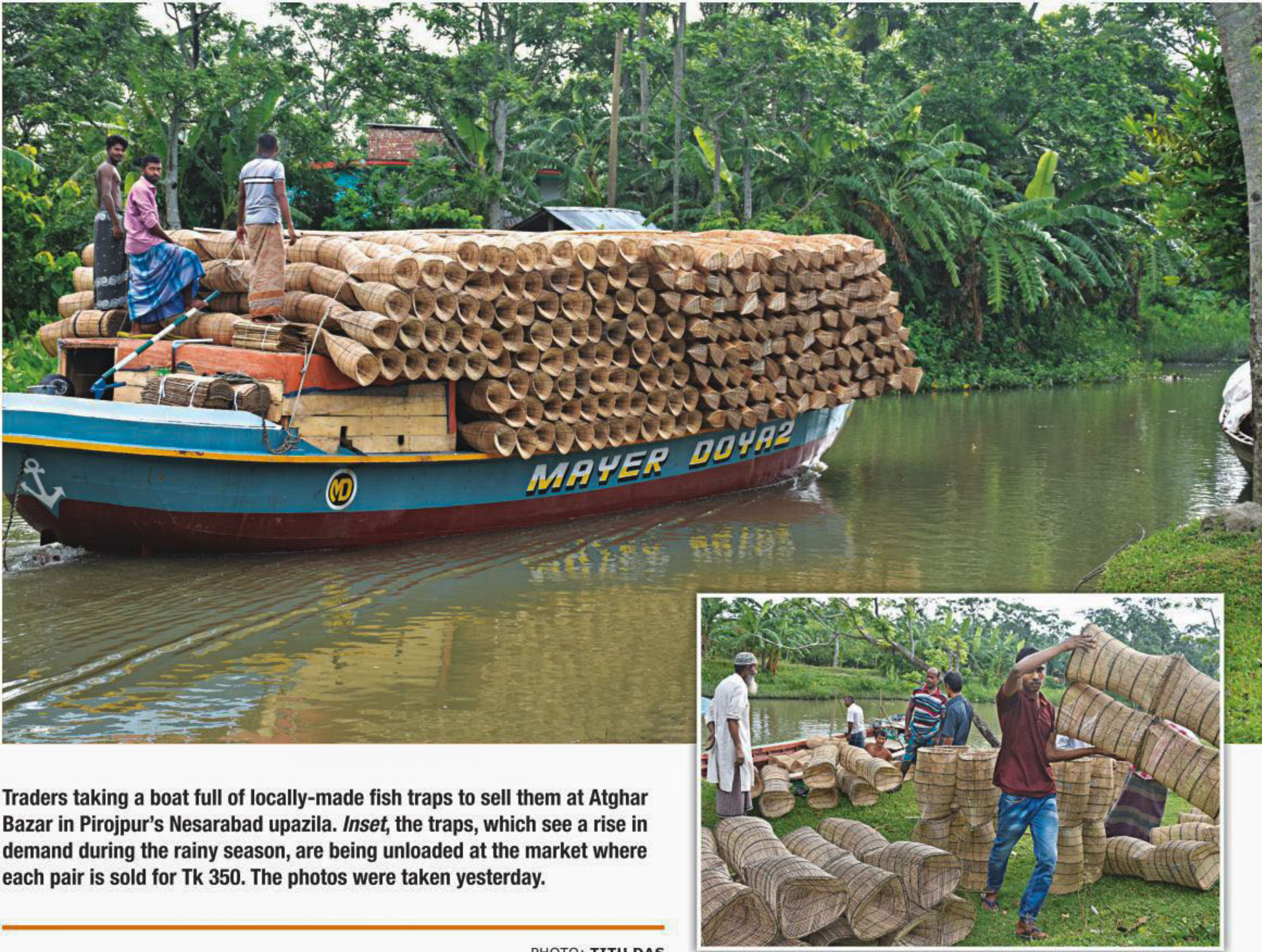
Traders taking a boat full of locally-made fish traps to sell them at Atghar Bazar in Pirojpur's Nesarabad upazila. Inset , the traps, which see a rise in demand during the rainy season, are being unloaded at the market where each pair is sold for Tk 350. The photos were taken yesterday.