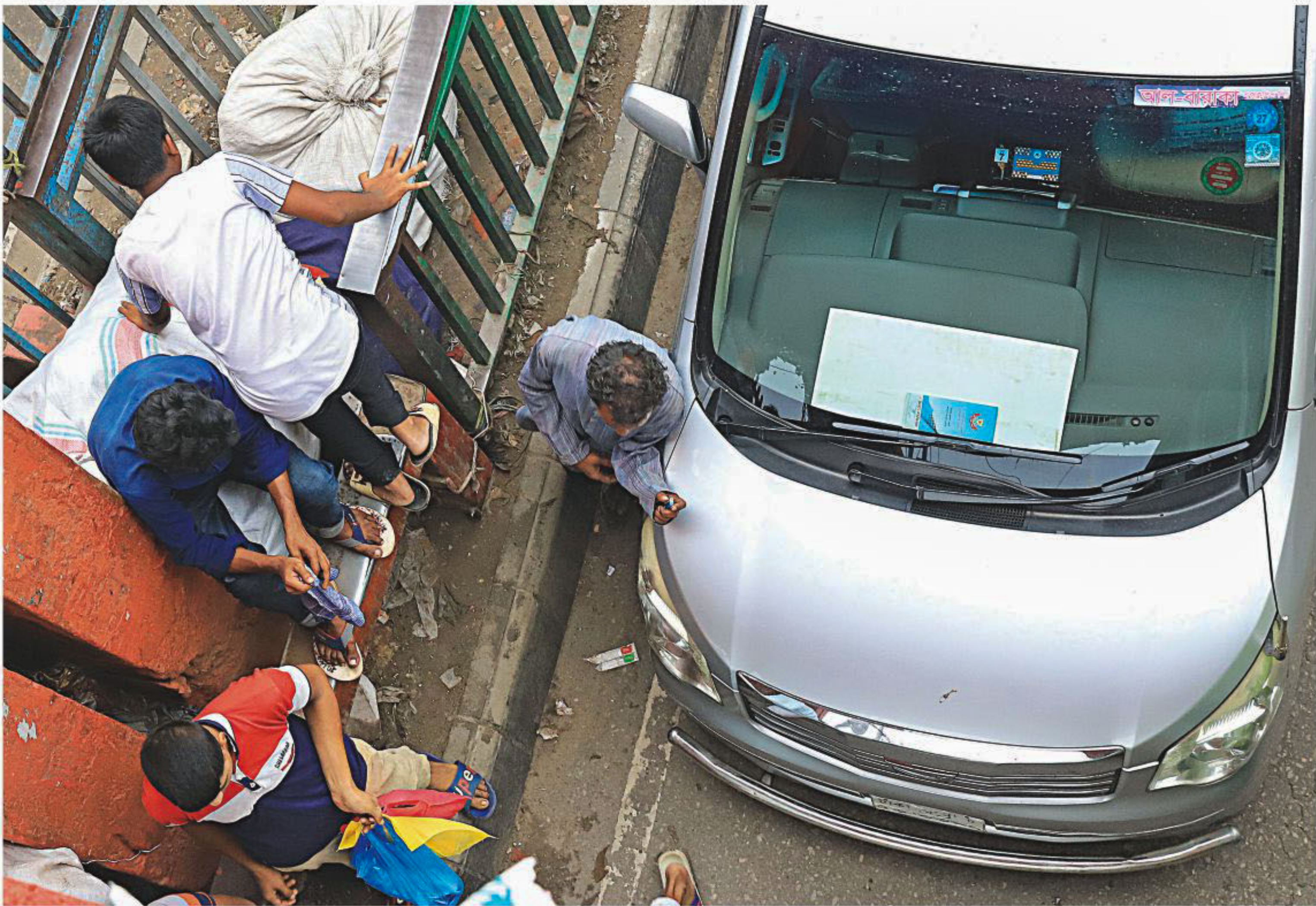
Though a footbridge is just above their heads, a boy climbs the railings of a median strip while a man squeezes through a gap between a car and the median strip to cross a street in the capital's New Market area yesterday. Many jaywalkers do the same on the busy road every day, putting their lives in danger.