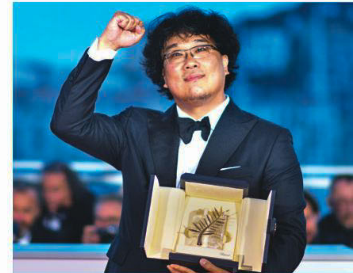
Bong Joon Ho