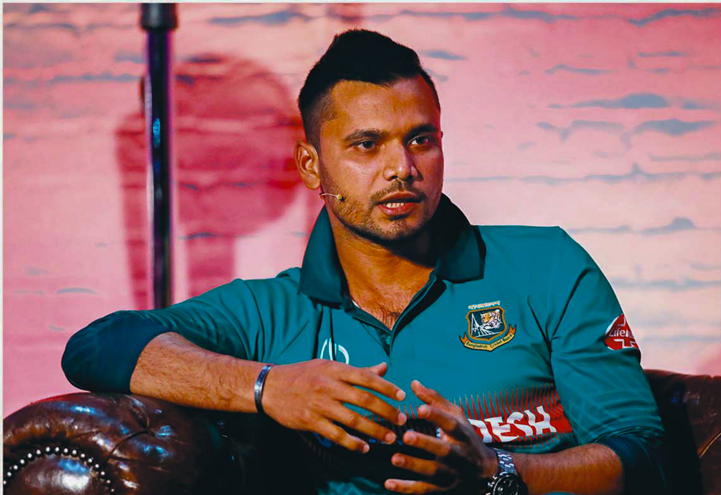
Bangladesh skipper Mashrafe Bin Mortaza answers questions during a press conference involving the captains of all 10 participating teams of the ICC Cricket World Cup, which begins on May 30. At the press conference, asked which opposition player he would have liked on the Tigers' squad, Mashrafe earmarked India's Virat Kohli.