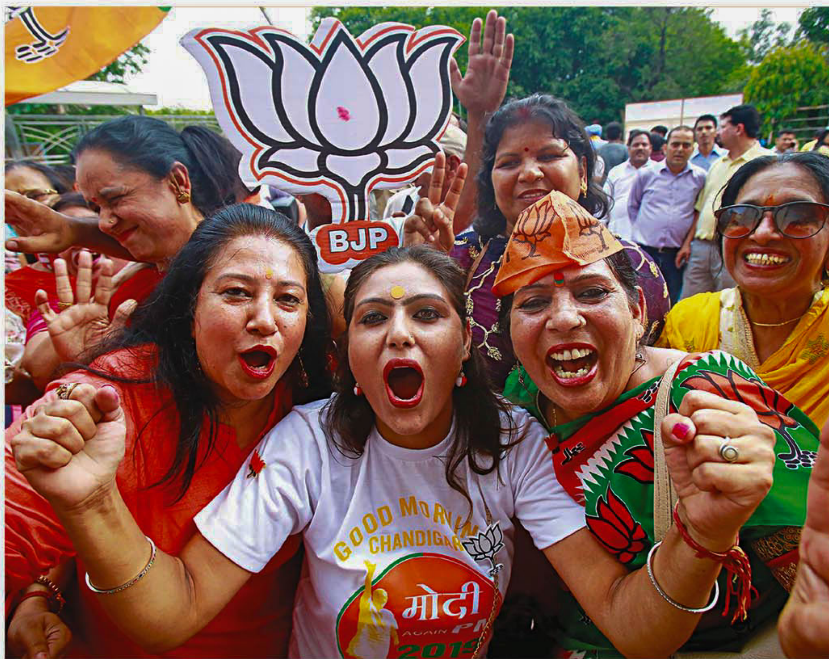
Supporters of Bharatiya Janata Party (BJP) celebrate yesterday after learning of initial polls results in Chandigarh, India.

MORE STORIES ON PAGE 9 - GLOOMIEST PHASE FOR GANDHIS, WEST BENGAL SEES SAFFRON SURGE, AMIT SHAH: THE ARCHITECT OF MODI'S VICTORY