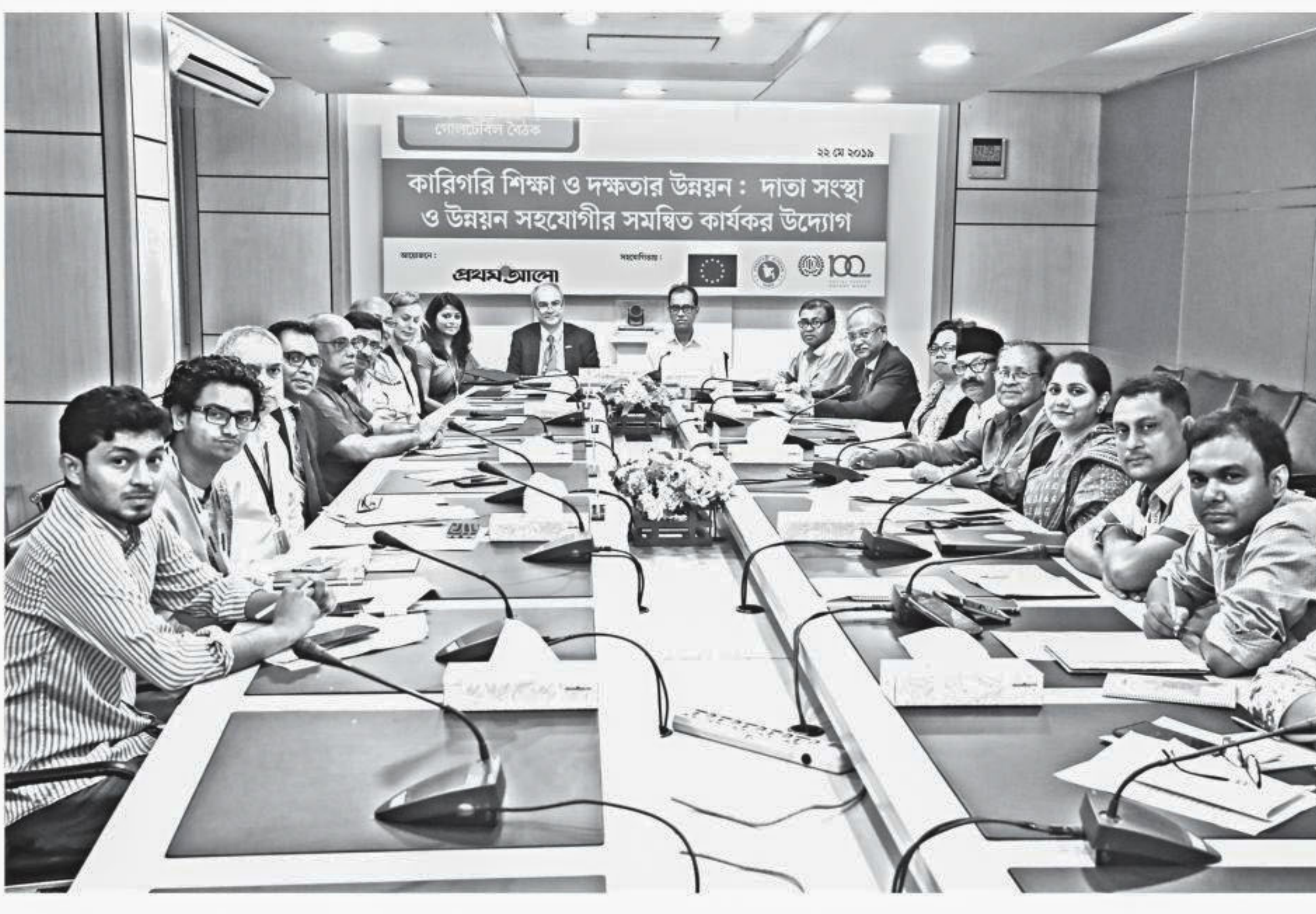
Participants at the roundtable on "Way to TVET SWAP: Opportunities and Challenges" yesterday. Prothom Alo organised the event at its office, in assistance with ILO Bangladesh.