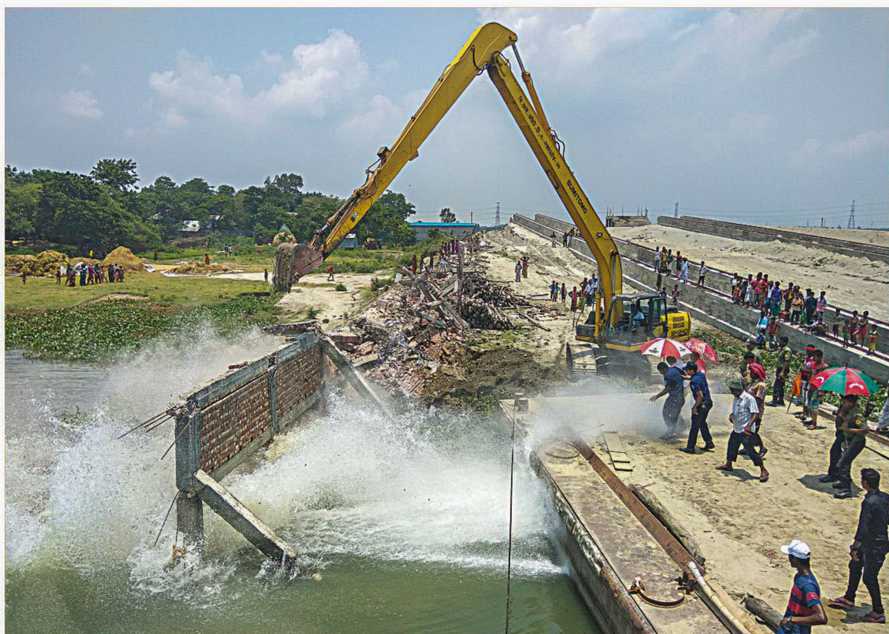
An excavator demolishing an illegal structure in the Meghna during a BIWTA drive in Char Betagi area of Munshiganj's Gazaria upazila yesterday.