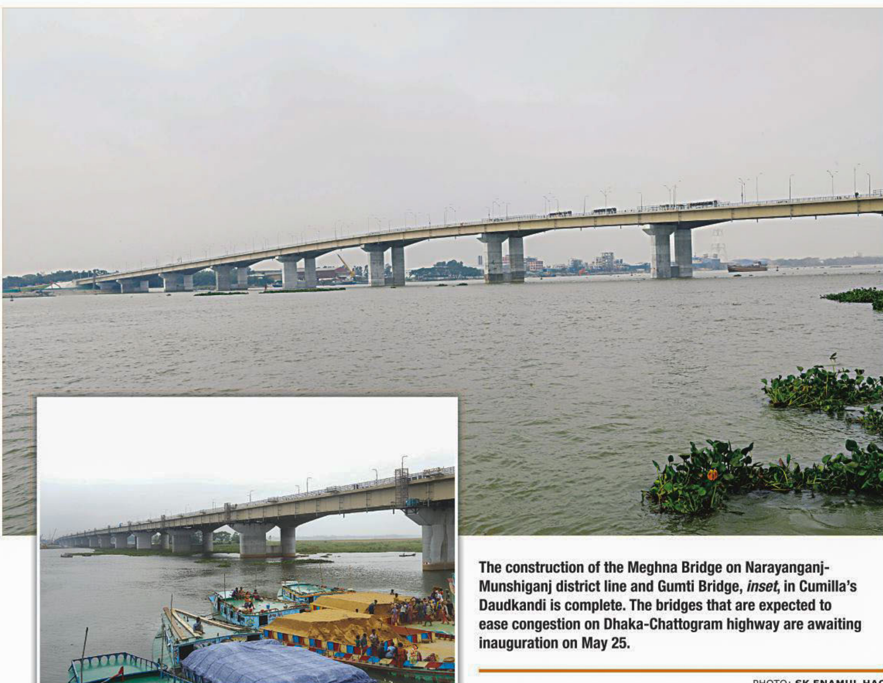
The construction of the Meghna Bridge on Narayanganj-Munshiganj district line and Gumti Bridge, inset, in Cumilla's Daudkandi is complete. The bridges that are expected to ease congestion on Dhaka-Chattogram highway are awaiting inauguration on May 25.