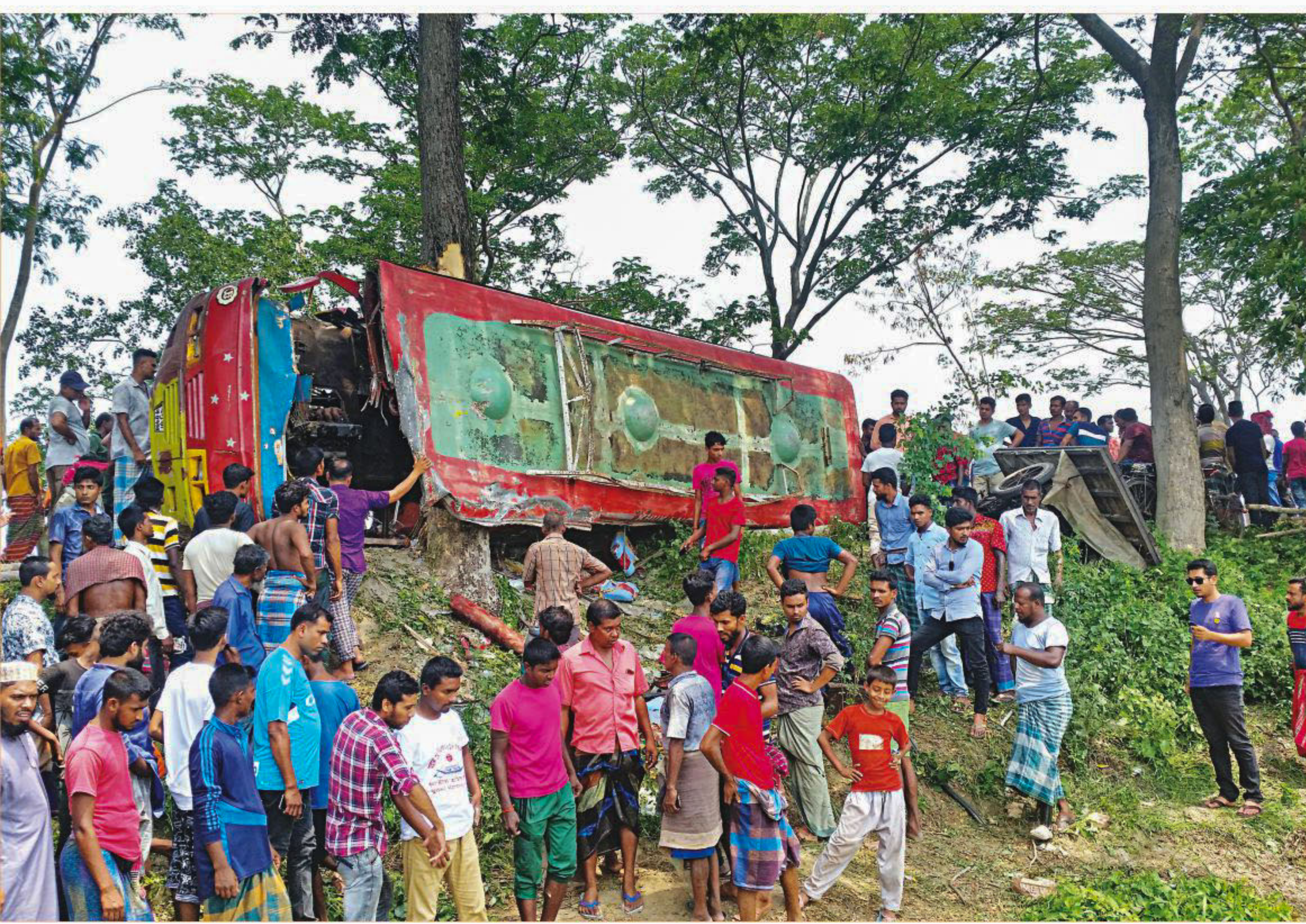
The bus flipped to its side and crashed into a tree which sliced the vehicle in Bagerhat's Fakirhat upazila yesterday morning. Six people were killed and 15 others injured in the crash.