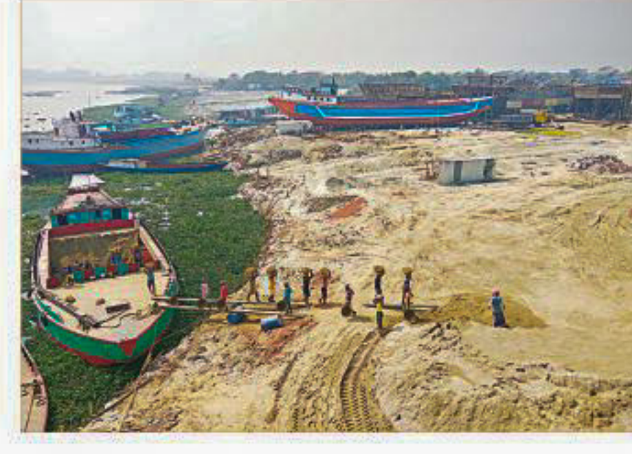
A vessel is being built on a swathe of the Meghna river filled up for the shipyard. Illegal encroachment on the river is going on unabated. The photos were taken recently at different places in Narayanganj's Sonargaon.