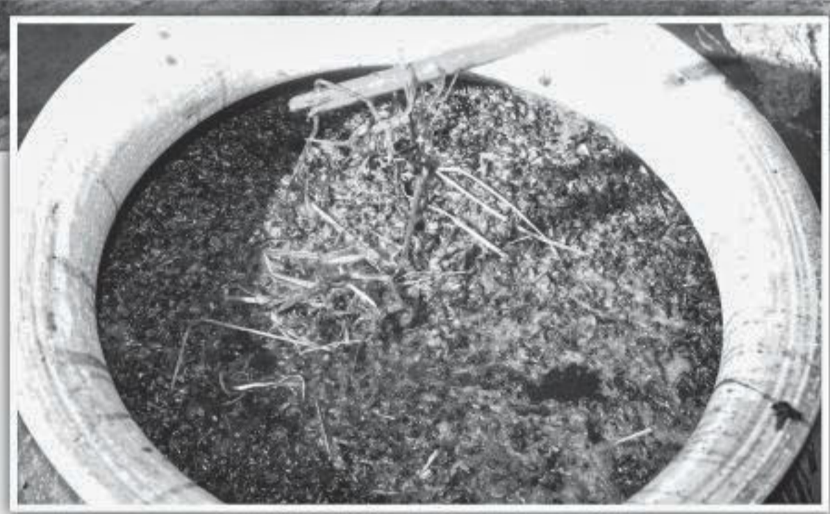
Adulterated molasses is being made at the factory in Nature's Gurudaspur upazila. A mobile court fined three local factories, including this one, Tk 9 lakh for producing adulterated molasses and also seized 1,980kg molasses. The photos were taken on Thursday.